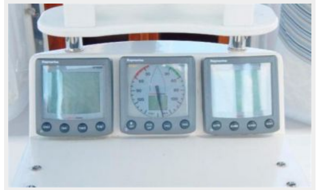
Speed, Depth, Wind