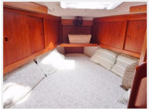
Guest Berth Forward