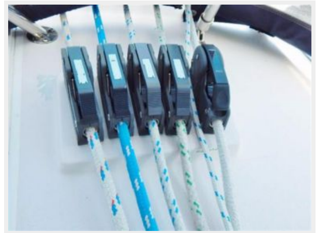
Rope Clutches Starboard