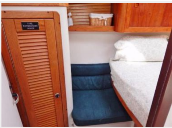
Guest Berth Port