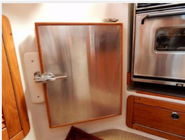
Galley Fridge Front