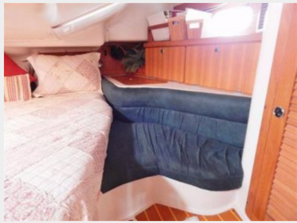
Master Berth Aft