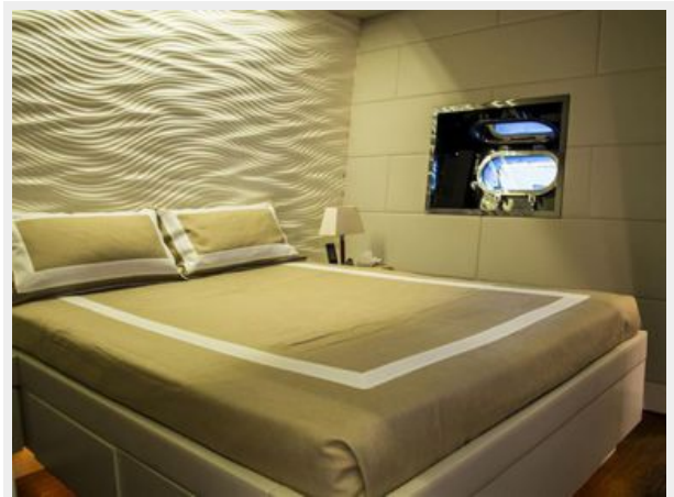
Double Guest Cabin