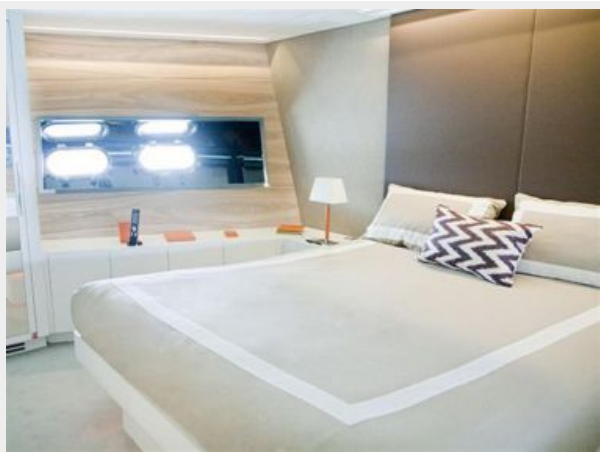
VIP Guest Cabin