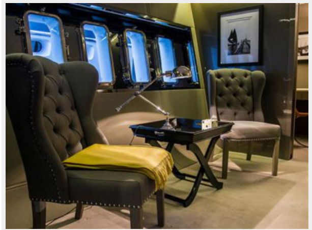
Master Cabin Seating Area