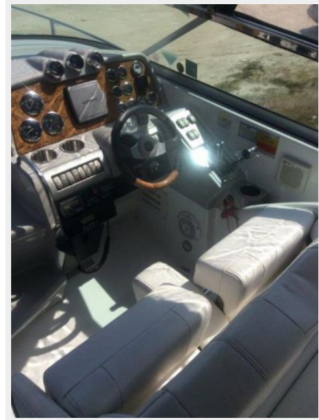
Helm with raised bolster seats