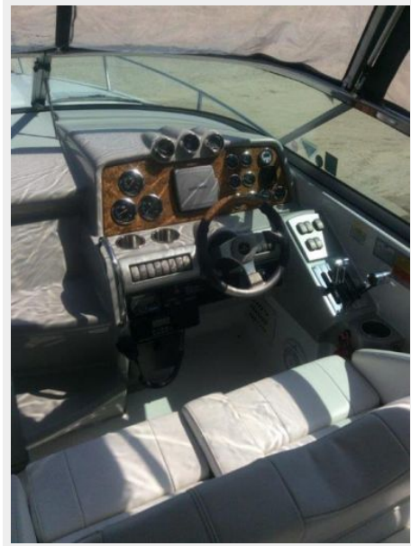
Helm with lowered bolsters