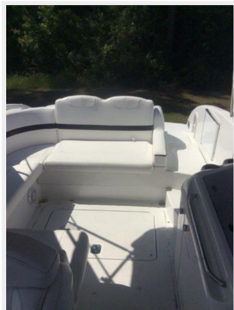
Cockpit facing aft