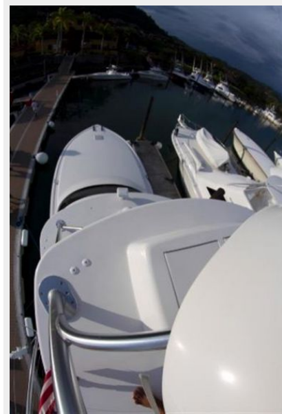
Bow View from Tower