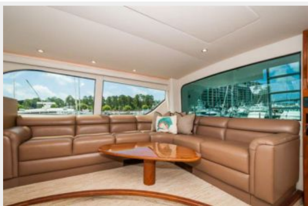
Enclosed Bridge Seating