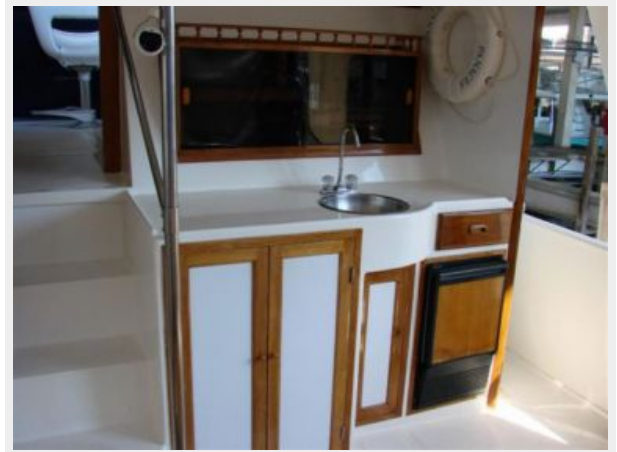
42' Novatec sundeck forward