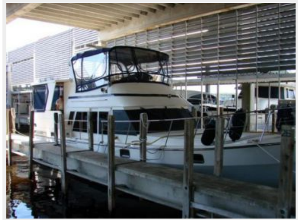
42' Novatec starboard forward profile