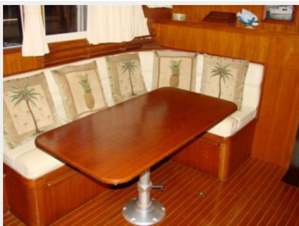
42' Novatec salon settee