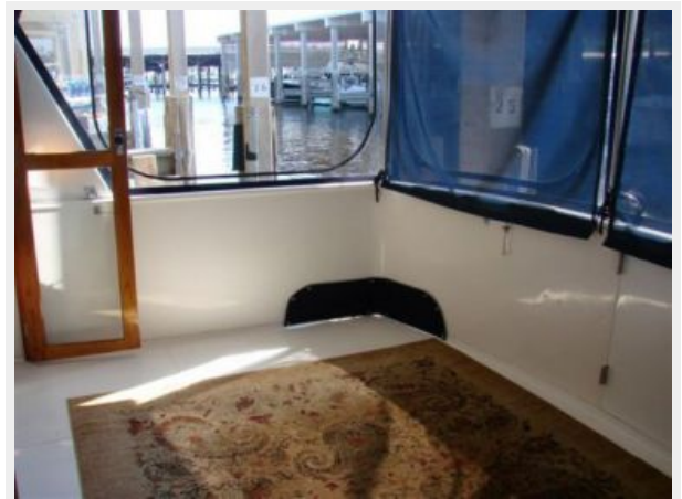
42' Novatec sundeck