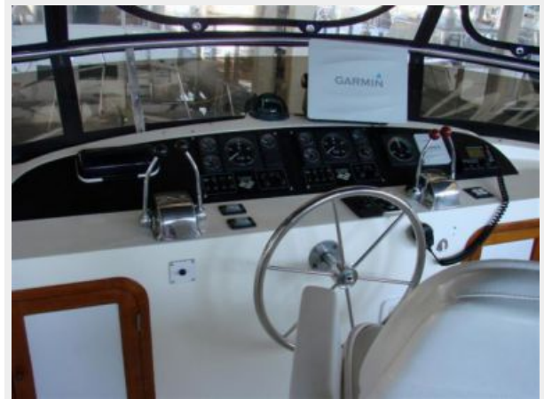
42' Novatec flybridge forward