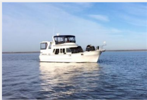
42' Novatec at anchor photo1