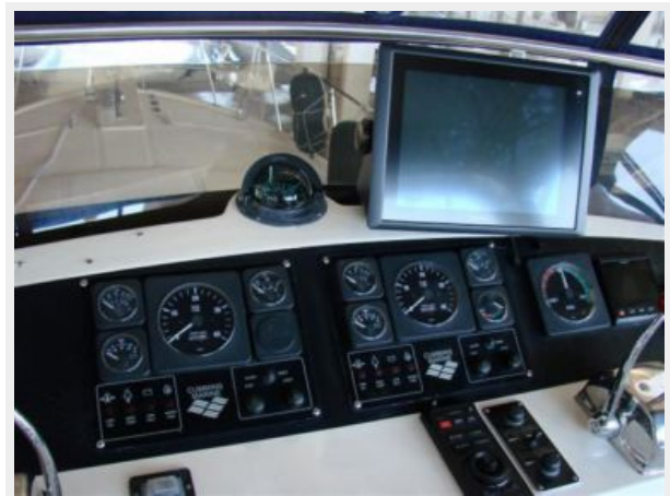
42' Novatec flybridge helm photo2