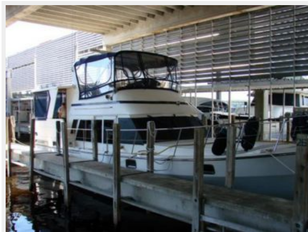
42' Novatec starboard forward profile