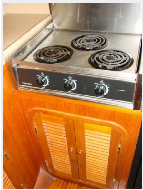
42' Novatec galley stove