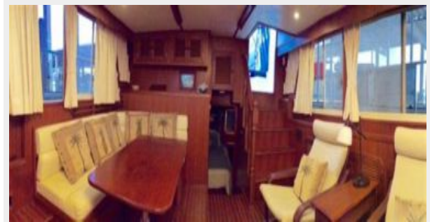
42' Novatec salon aft