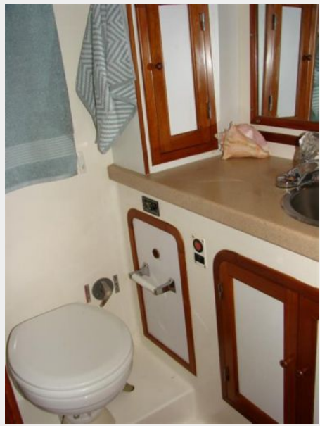
42' Novatec master stateroom head