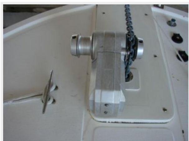
42' Novatec anchor windlass