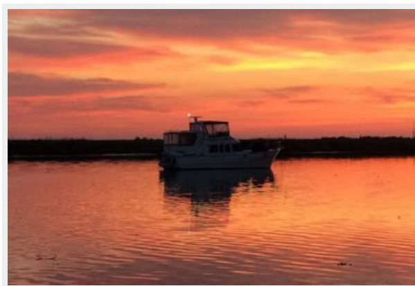
42' Novatec at anchor photo2