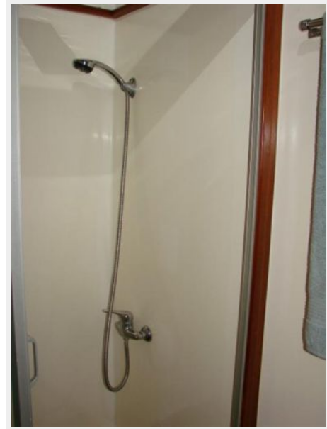
42' Novatec guest stateroom starboard