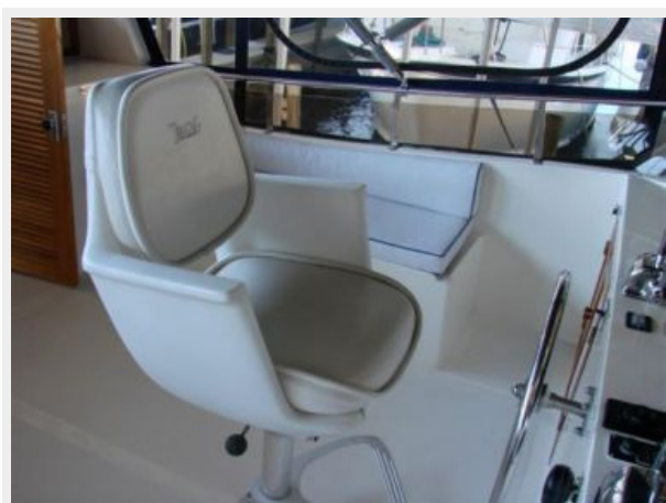
42' Novatec flybridge helmseat