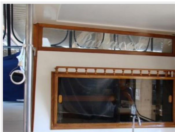
42' Novatec sundeck etched glass