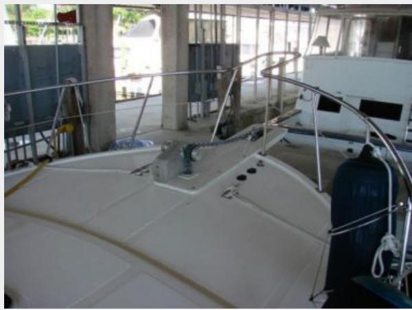
42' Novatec foredeck