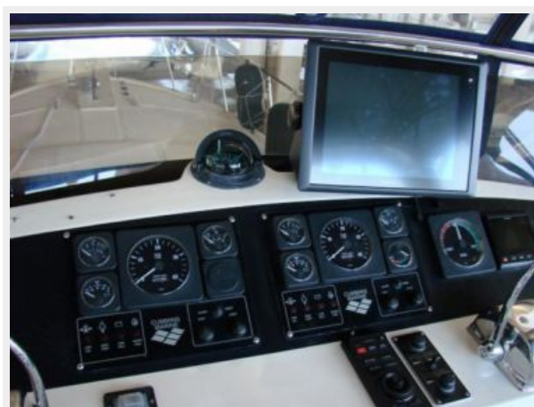
42' Novatec flybridge helm photo2