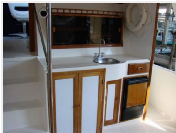
42' Novatec sundeck forward