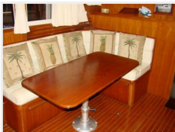
42' Novatec salon settee