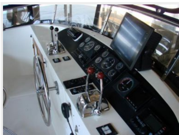
42' Novatec flybridge helm photo1