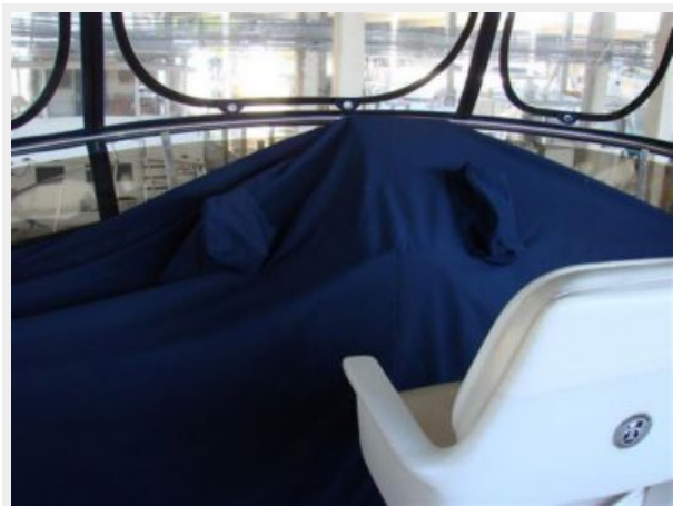
42' Novatec flybridge cover