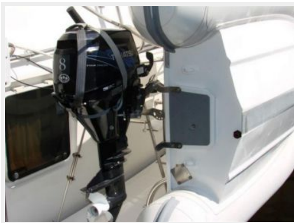
42' Novatec tender outboard