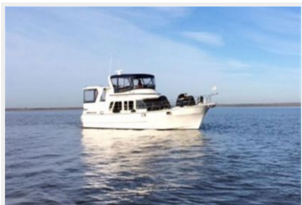
42' Novatec at anchor photo1