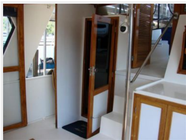
42' Novatec sundeck port forward