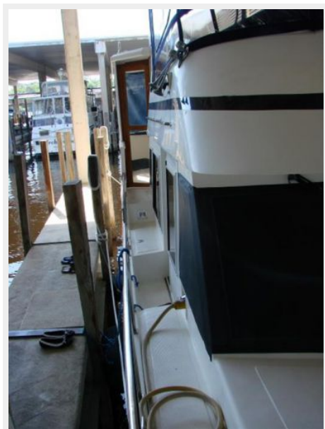
42' Novatec starboard side deck