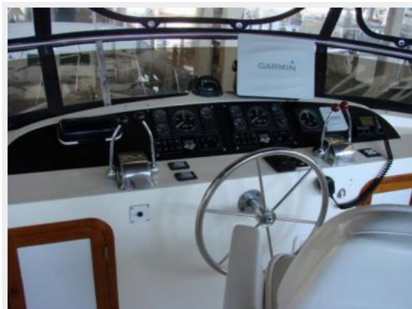
42' Novatec flybridge forward