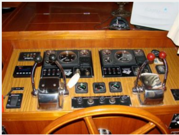
42' Novatec lower helm