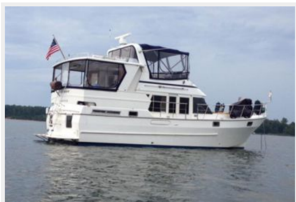
42' Novatec starboard profile