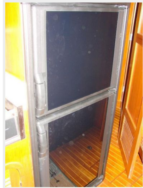
42' Novatec galley refrigerator