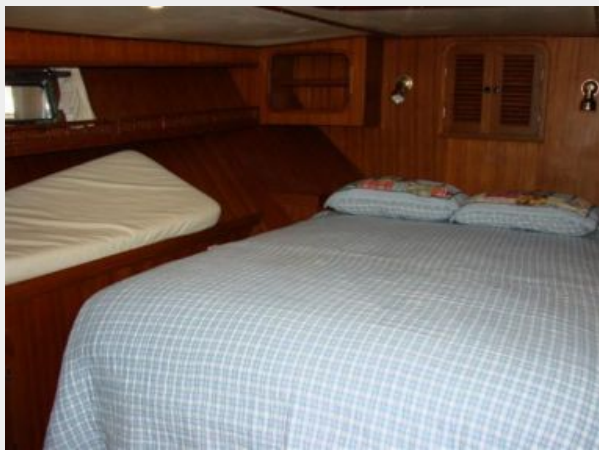
42' Novatec guest stateroom port