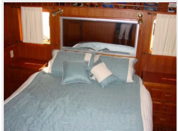
42' Novatec master stateroom photo2