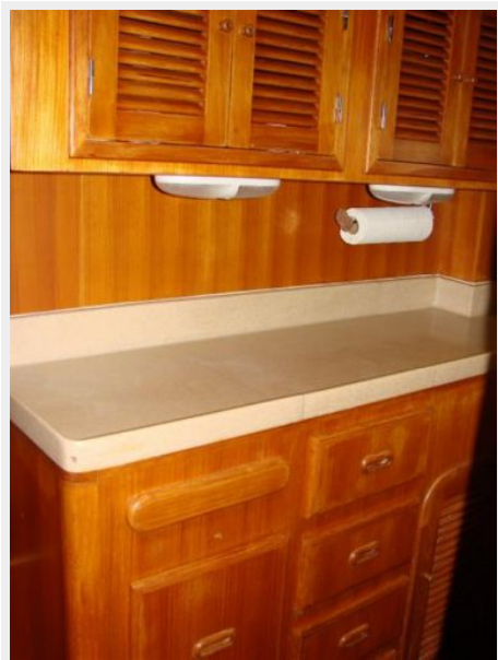
42' Novatec galley cabinetry