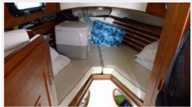
Forward berth - Porta potty fits in small head compartment.