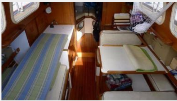
Interior looking forwards