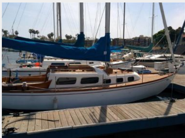
In the slip starboard side II