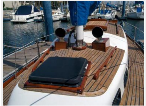
Foredeck looking aft