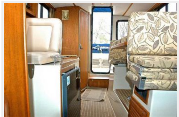
Cabin Aft View