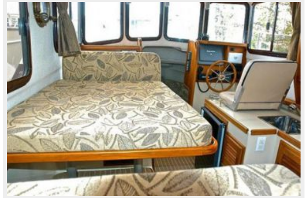
Dinette Double Sleeper