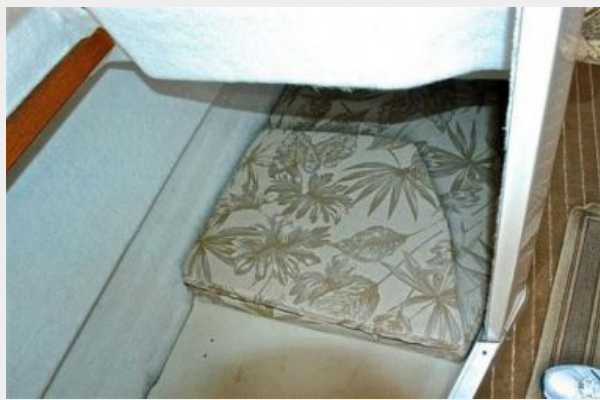
Single Berth Below Port Side