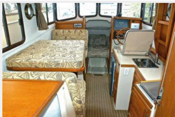
Cabin Forward View