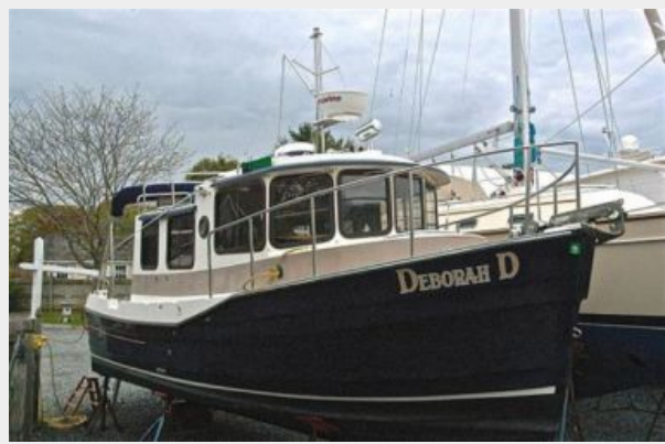
Hull Starboard Side