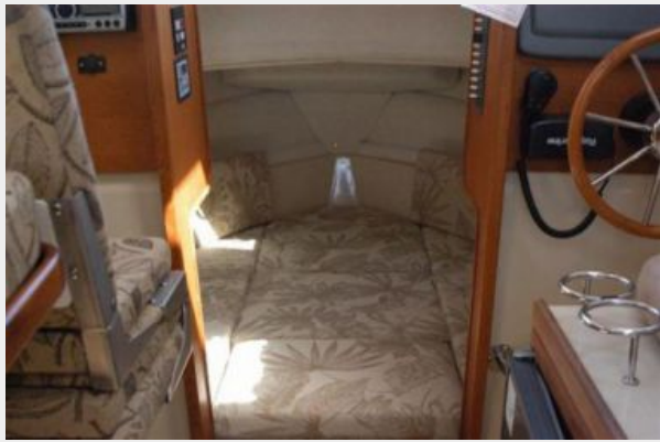
Forward Berth View 2