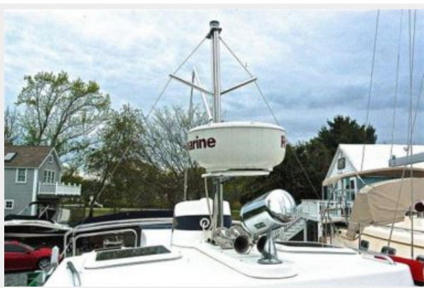
Cabin Roof Top