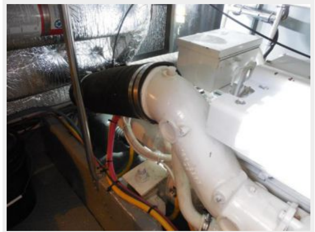
Engine Port Aft