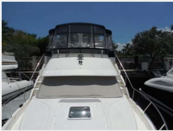
Bow Looking Aft