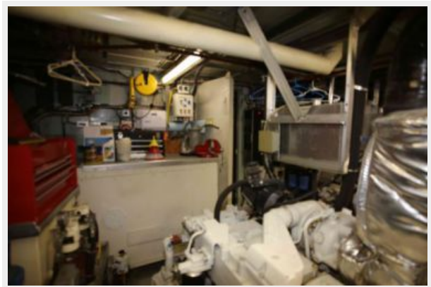
Kilo Pak Work Bench