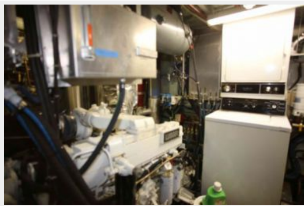
Day Tank - Air Tank - Wesmar - Tank