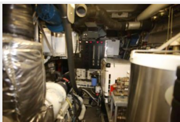
Panel - Water Pumps - Watermaker