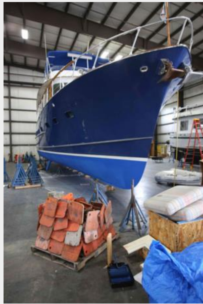
Bow - Out of Water