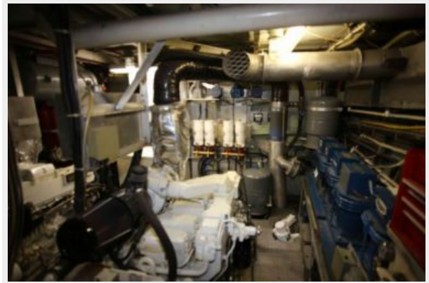
AC Compressor, Air Compressors, Water Pressure Tanks, Racors, Fuel Gauges