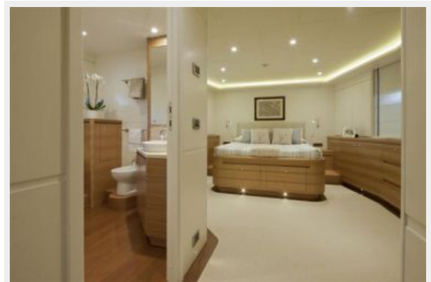
Master cabin - Sister ship