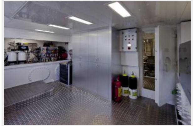
Lazaretto - Sister ship