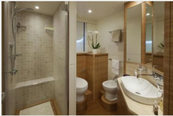
Guest bath - Sister ship