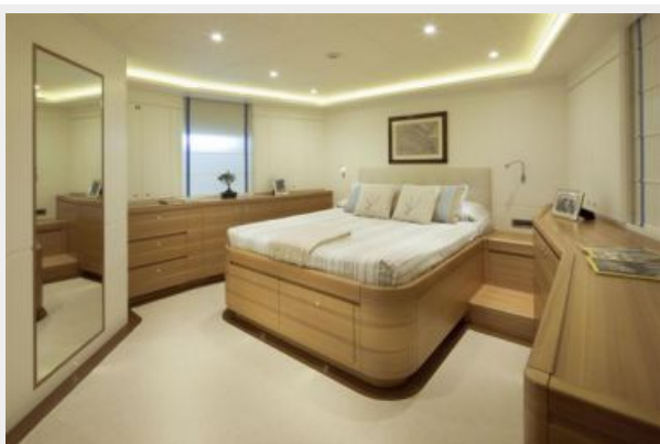
Master Cabin - Sister ship