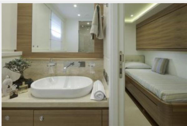
Guest bath - Sister ship