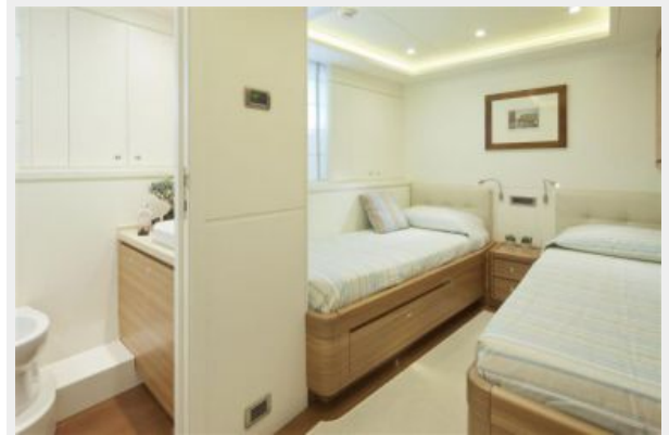
Guest cabin - Sister ship