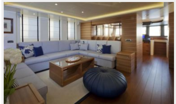
Sky lounge - Sister ship