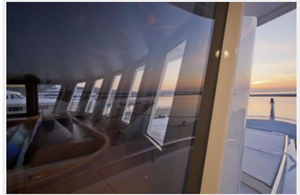
Bridge windows - Sister ship