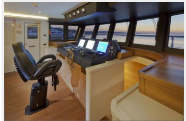
Wheel house - Sister ship