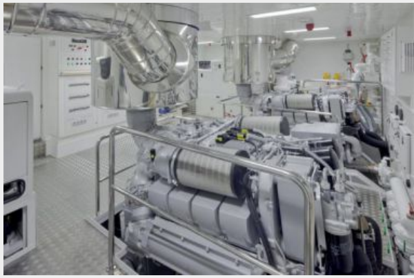
Engine room - Sister ship