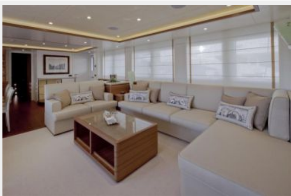
Main salon - Sister ship