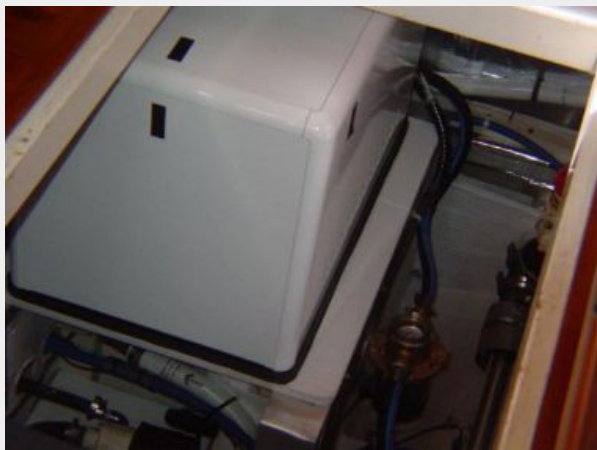
Engine Room Gen Set