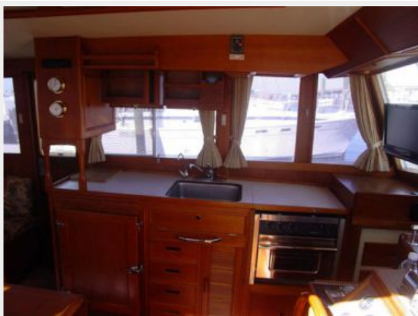
Galley dish lockers down