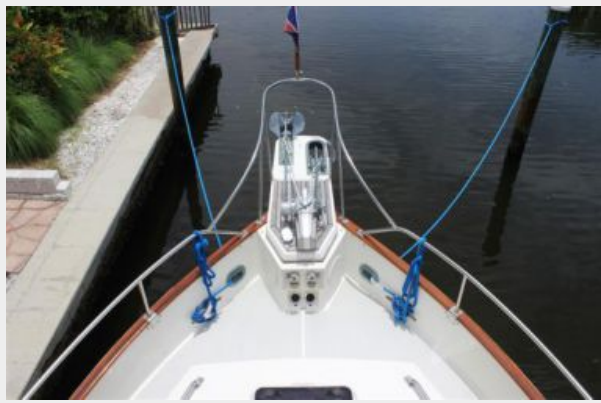
Foredeck and Ground Tackle