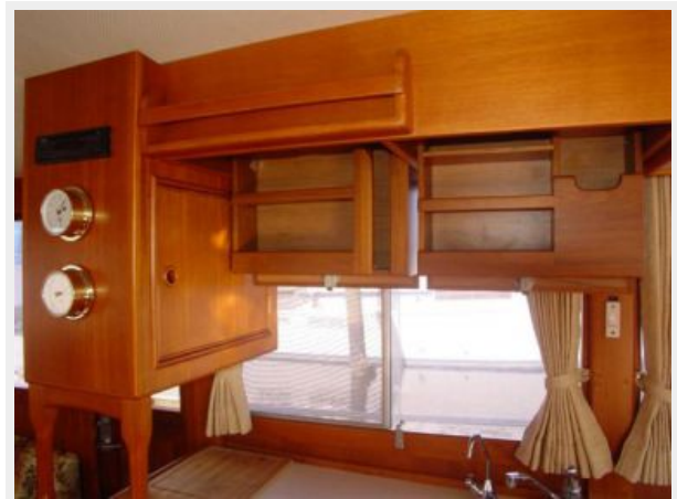
Galley drop down dish lockers