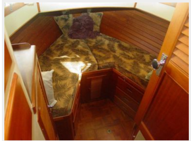
Guest Stateroom Forward