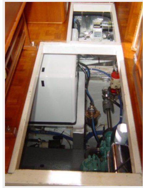
Engine Room VacuFlush system