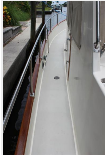
New Non-Skid Side Decks