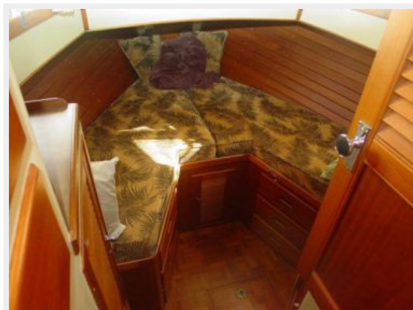
Guest Stateroom Forward