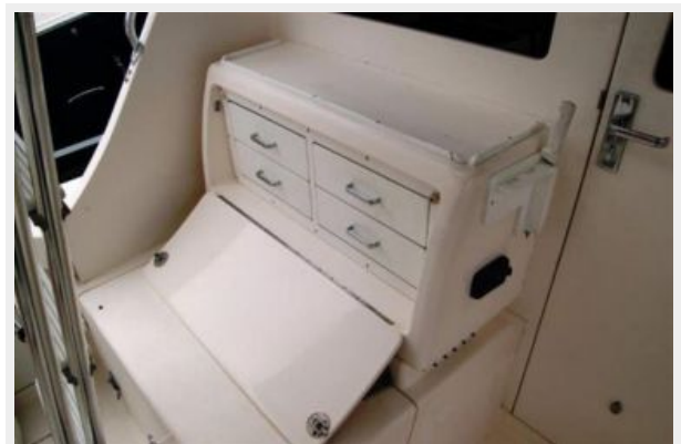
Cockpit-Tackle Drawer to Port