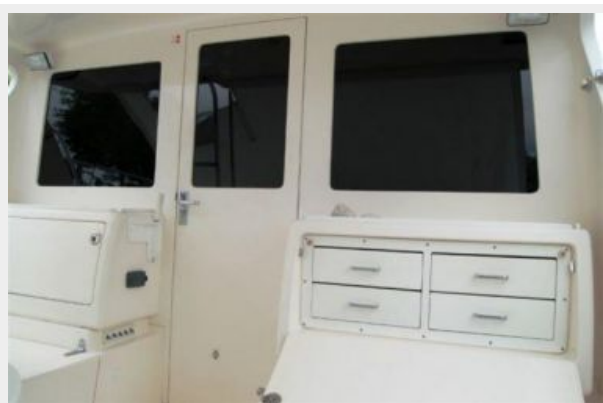
Cockpit-Tackle Storage Port and Starboard