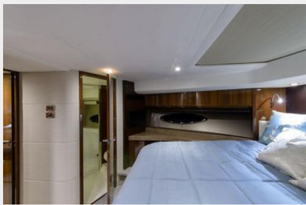
VIP Stateroom - Forward