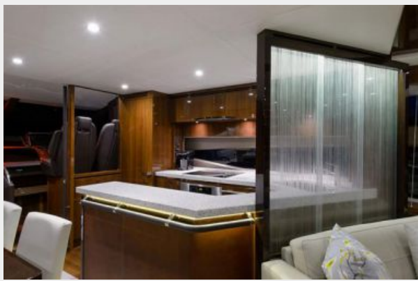
Galley - Closed Divider