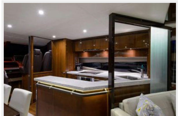
Galley - Open Divider