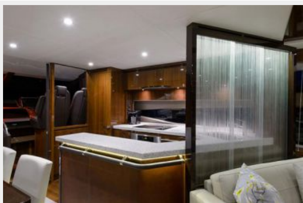
Galley - Closed Divider