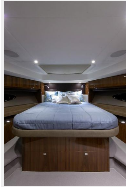
VIP Stateroom - Forward