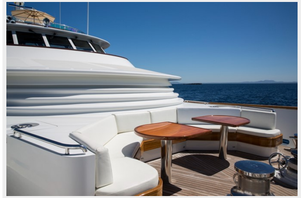
Seating area bow main deck