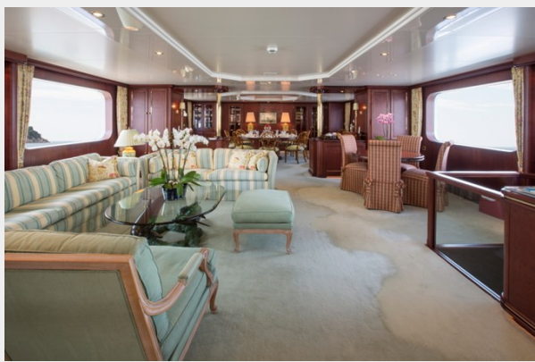
formal seating main deck saloon