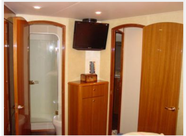
Master Stateroom 3 - TV