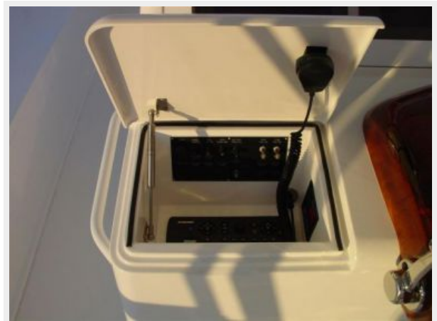
Helm / Electronics & Navigation 4