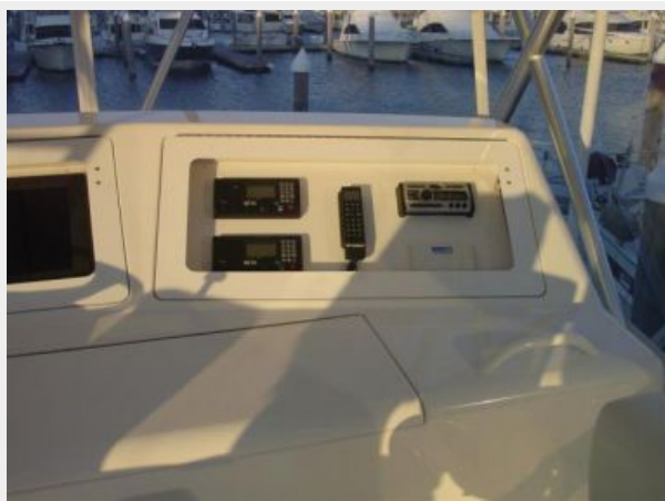
Helm / Electronics & Navigation 3