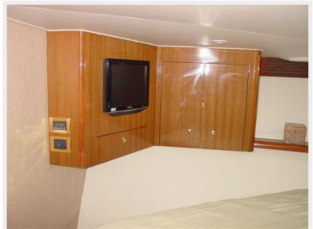
Guest Stateroom, Forward 2 - TV