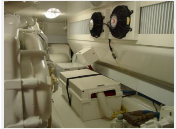
Engine & Mechanical Equipment 4