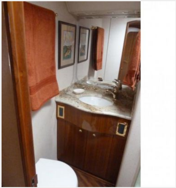
Guest Head 1