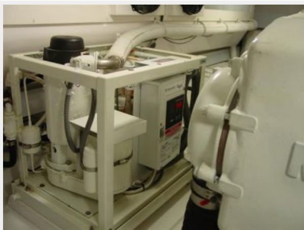
Engine & Mechanical Equipment 5