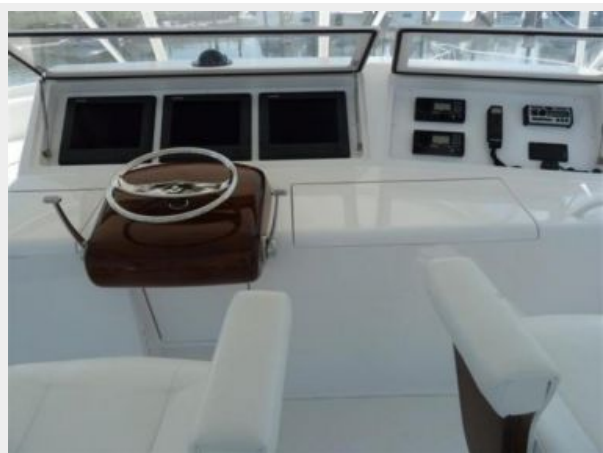
Helm / Electronics & Navigation 1