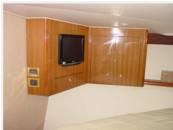
Guest Stateroom, Forward 2 - TV