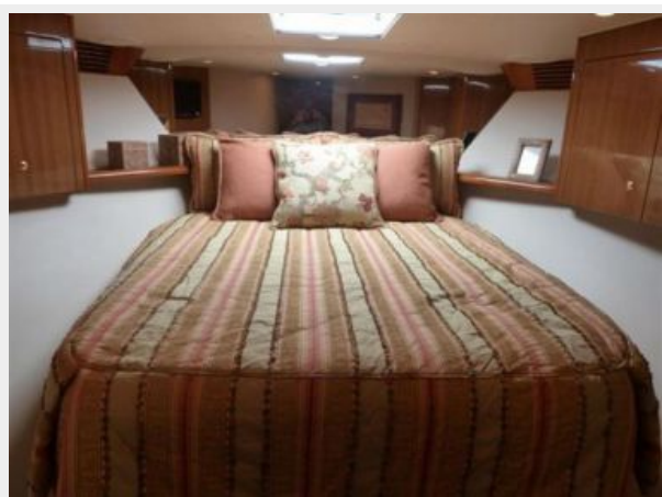
Guest Stateroom, Forward 1