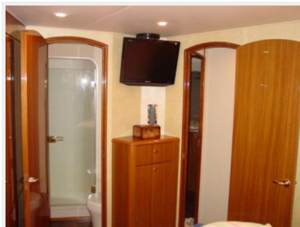
Master Stateroom 3 - TV