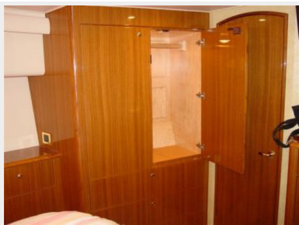
Master Stateroom 2 - Hanging Locker