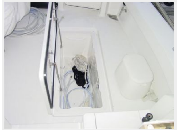
Cockpit / Fishing Equipment 5