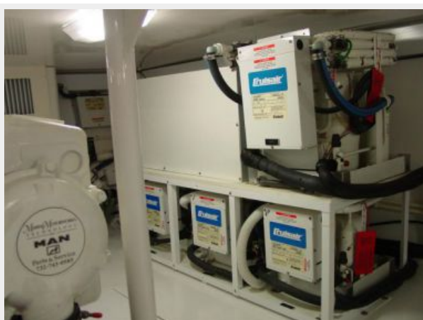
Engine & Mechanical Equipment 7 - Cruisair