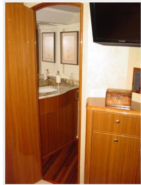
Master Head 1 - Vanity