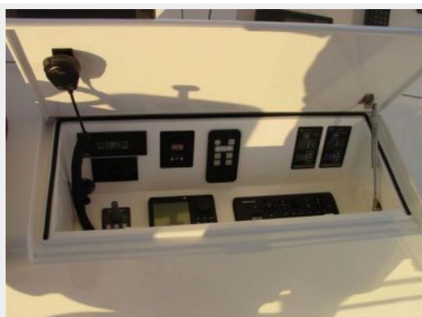
Helm / Electronics & Navigation 5