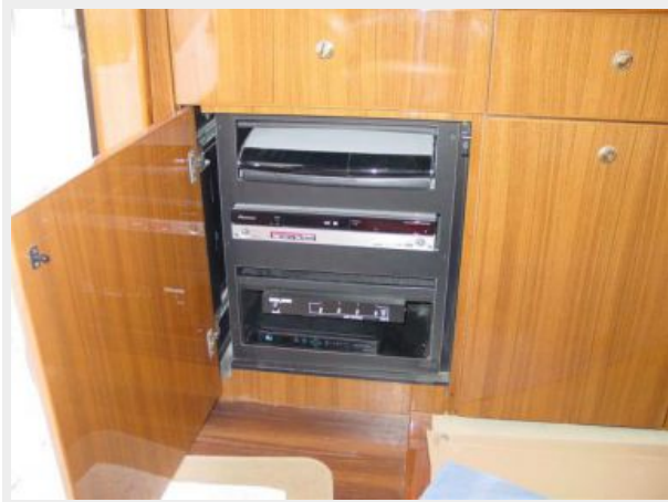
Salon 7 - Entertainment System