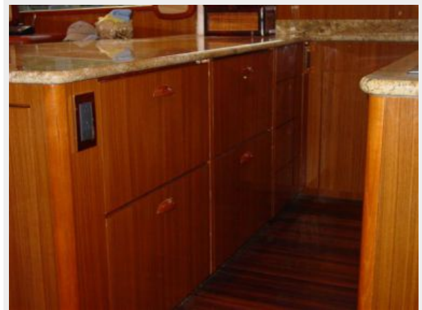
Galley 4 - Under Counter Refrigerators & Freezers