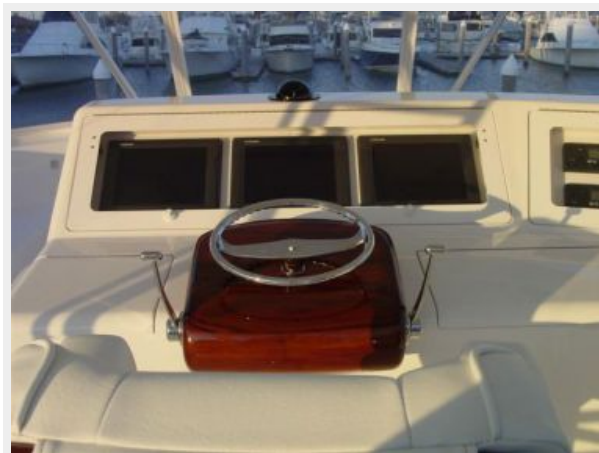
Helm / Electronics & Navigation 2