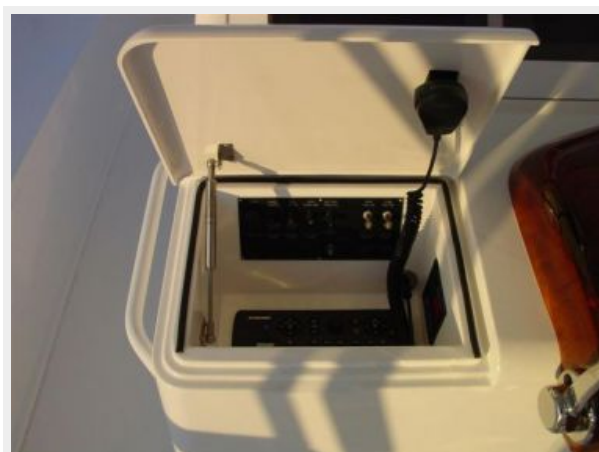
Helm / Electronics & Navigation 4