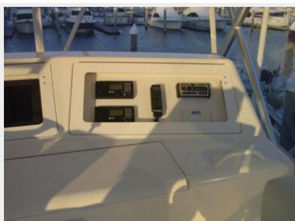
Helm / Electronics & Navigation 3