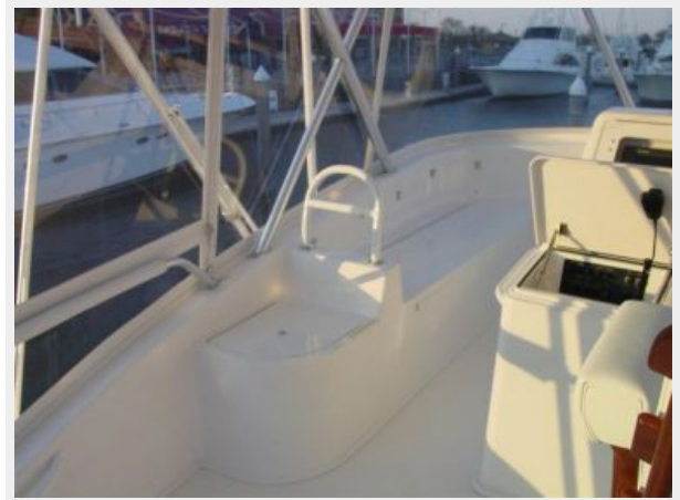
Deck 5 - Seating