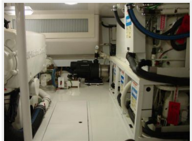
Engine & Mechanical Equipment 6