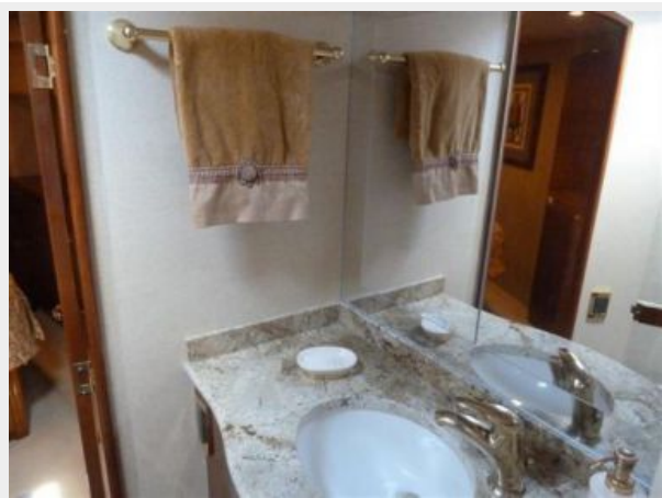
Master Head 2