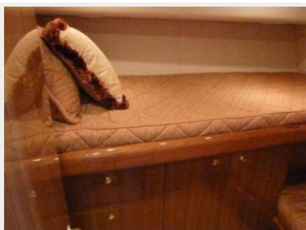
Guest Stateroom, Amidship Starboard 1