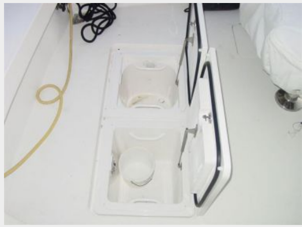
Cockpit / Fishing Equipment 4