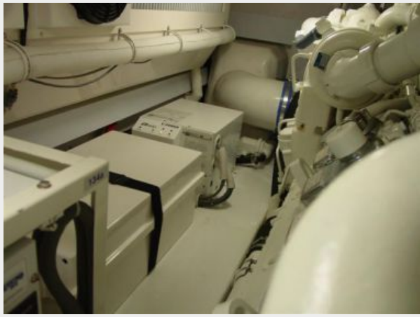
Engine & Mechanical Equipment 3