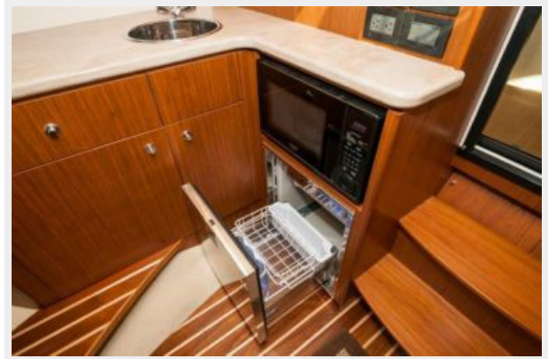
Microwave & Refrigerator