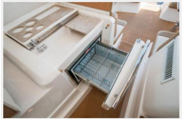
Cockpit Refrigerator & Wetbar