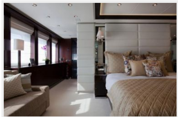
PERLE NOIRE - Master cabin