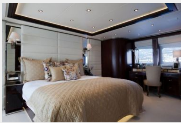
PERLE NOIRE - Master Cabin full beam