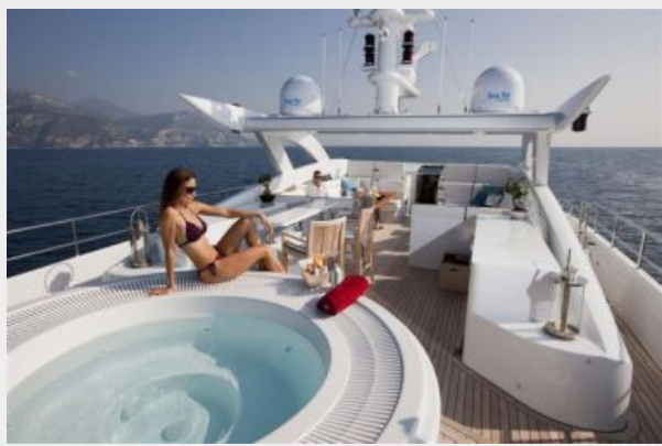
PERLE NOIRE - Sundeck with Jacuzzi