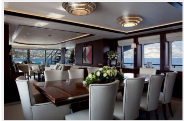
PERLE NOIRE - Main Saloon