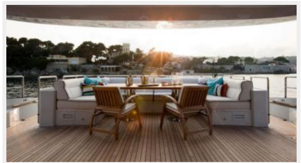
PERLE NOIRE - Running