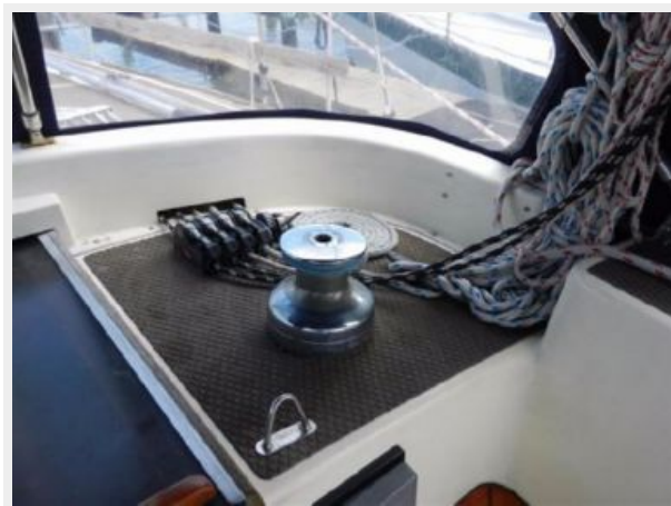
Line clutches for main starboard