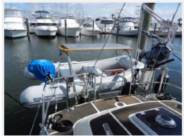
Outboard hoist 9.9 Mercury outboard