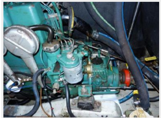
passageway access to engine