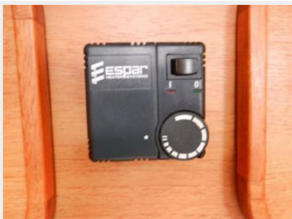
Espar heater control