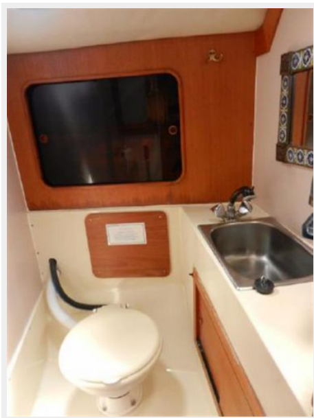
Private master head