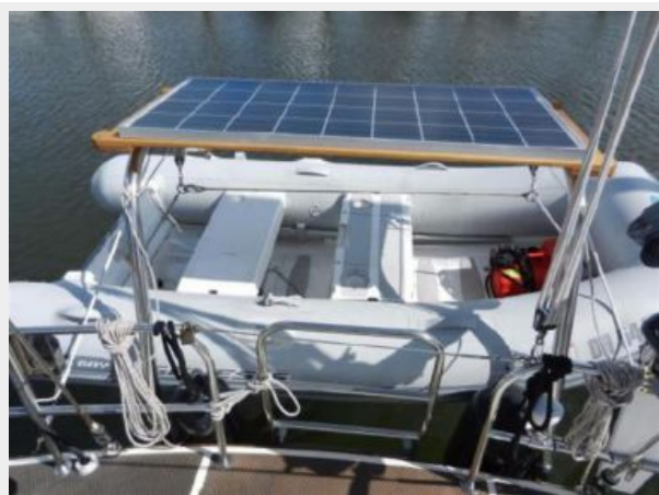
Walker Bay RIB dingy