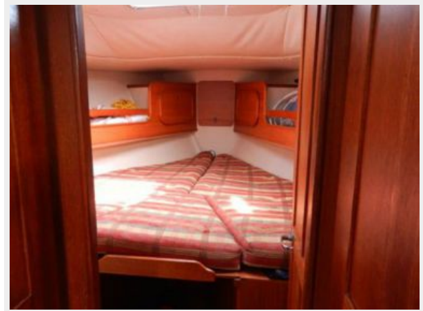
V berth with filler