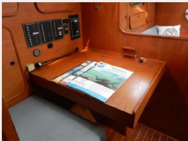
Forward facing nav desk