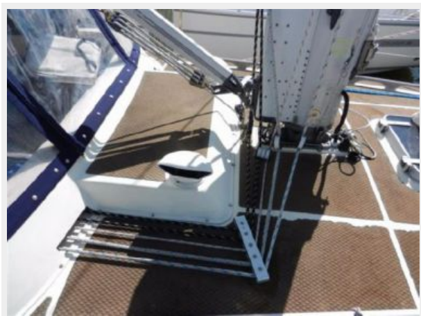
Lines leading to cockpit