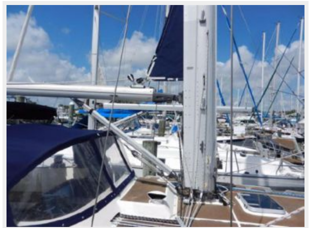
Furlex In mast main furling sail