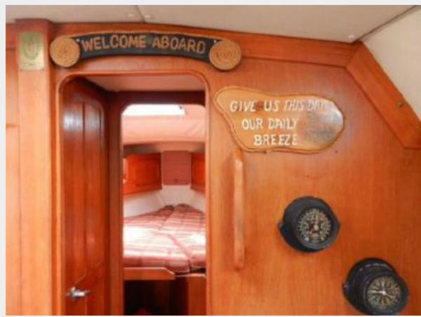
Head to port and large hanging locker to starboard