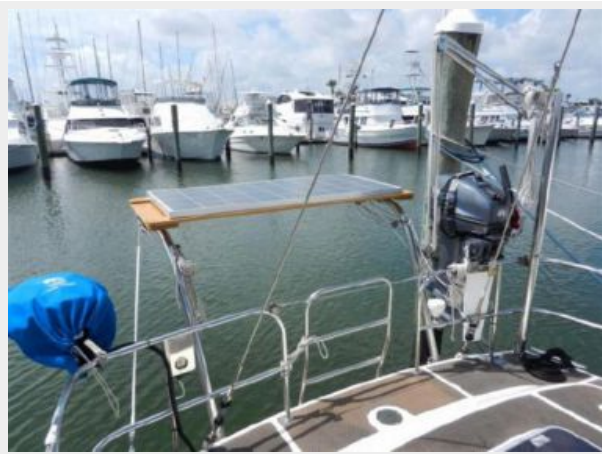
Solar panel, BBQ