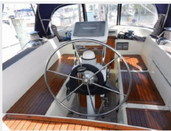
Helm instruments on Navpod