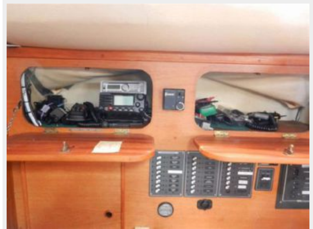
VHF w/AIS and electric panel