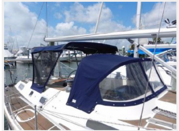
Dodger and Bimini with side enclosure