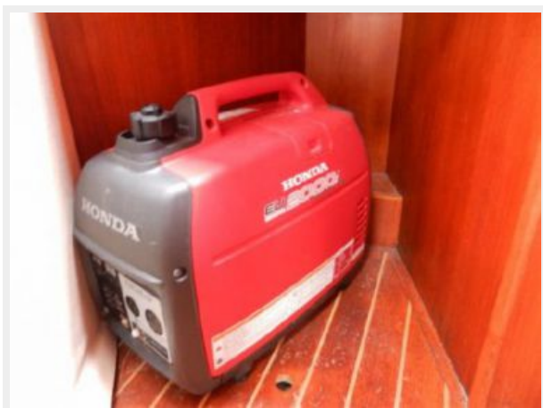
Honda 2000 portable generator