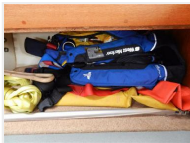
Lee board berth and storage space