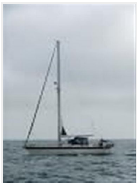
High Spiritis underway