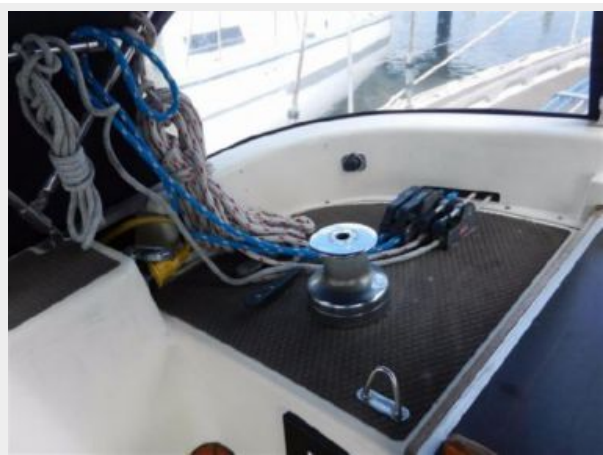
Line clutches for genoa port