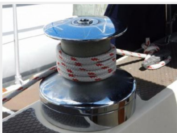
Barlow 32# primary winches