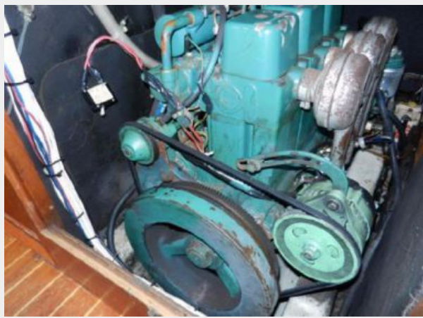
front access to Volvo engine