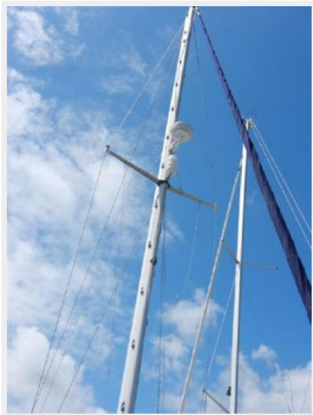
Rigging and mast steps