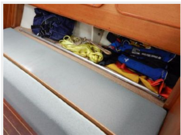
Suspenders tethers jacklines