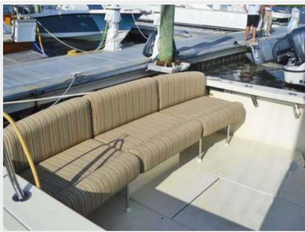
Sunbrella Stern Seating