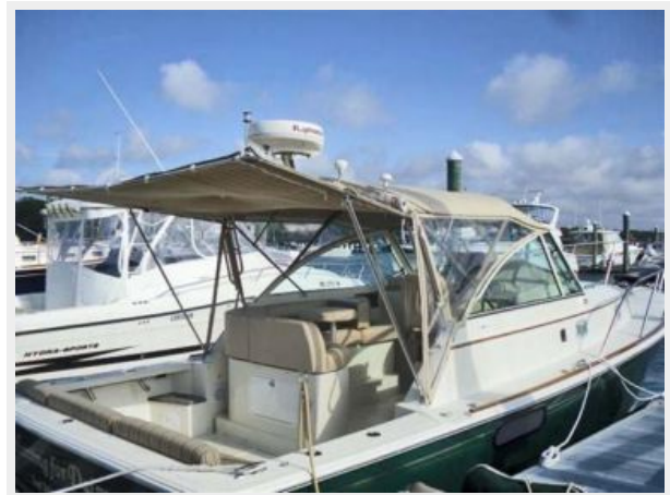
Removable Cockpit Awning