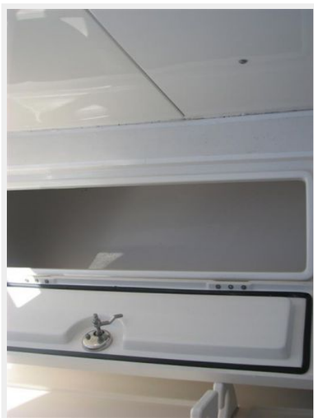
Deck 5 - In-Deck Rod Storage