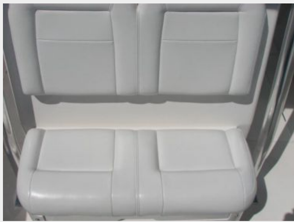
Deck 3 - Cooler Seat