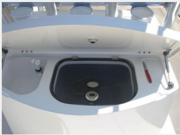
Cockpit / Fishing Equipment 2 - Live Well