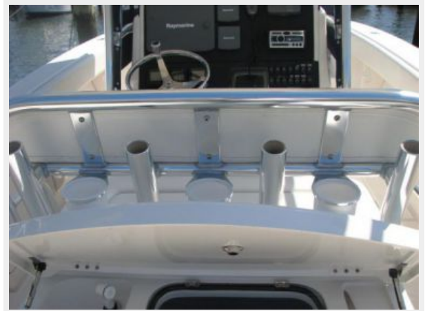
Cockpit / Fishing Equipment 1 - Leaning Post Rocket Launcher