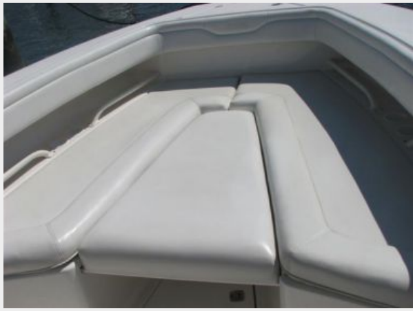
Deck 1 - Forward Seating With Filler