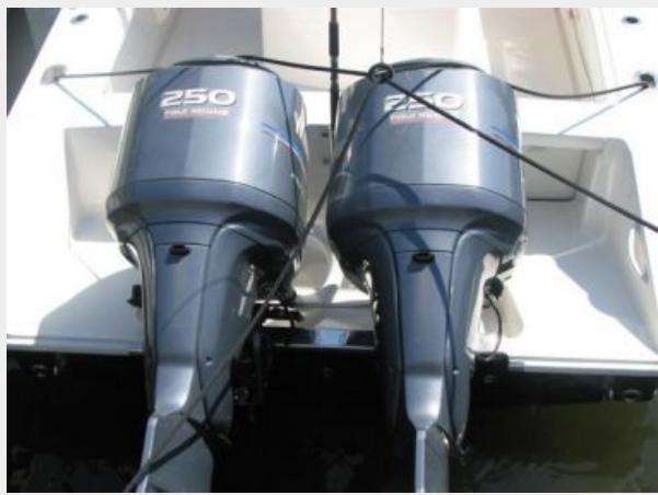
Engine & Mechanical Equipment 2 - Yamaha F-250's