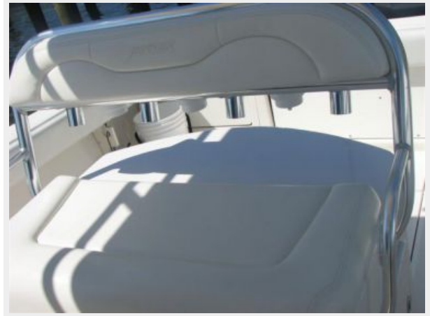
Deck 2 - Console Seating