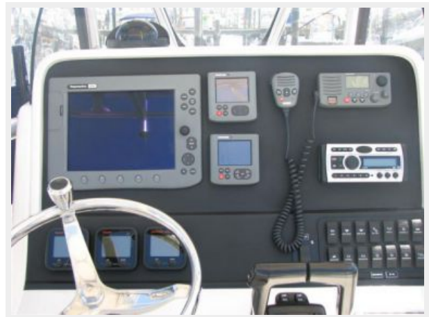
Center Console / Electronics & Navigation 3 Center Console / Electronics & Navigation 4 - Controls - Radar & Riggers