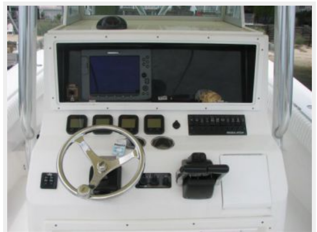
Center Console / Electronics & Navigation 1