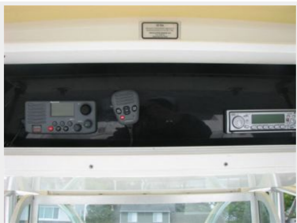
Center Console / Electronics & Navigation 2