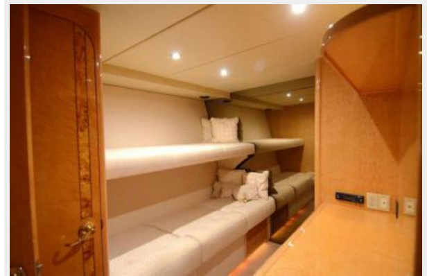
Guest Stateroom 2