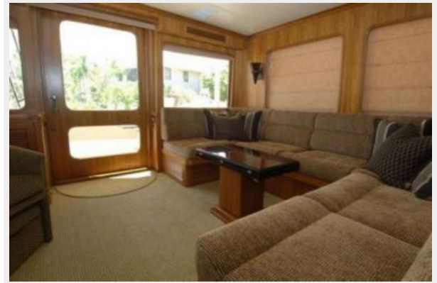
Main Salon Aft View