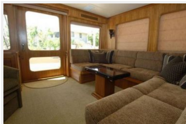
Main Salon Aft View