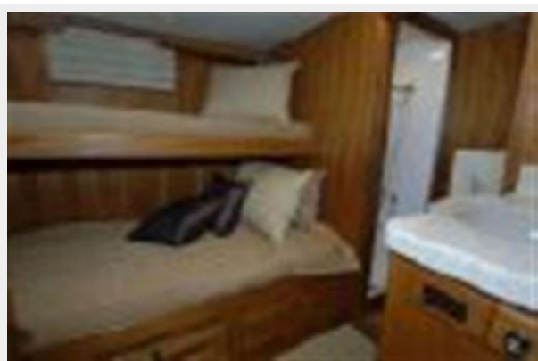
Guest Stateroom 2