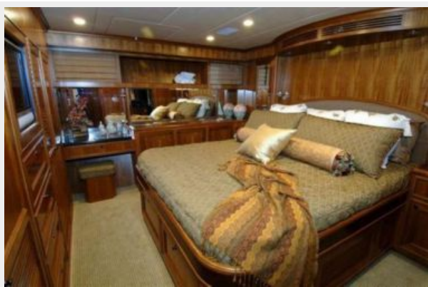
Full Beam Master Stateroom