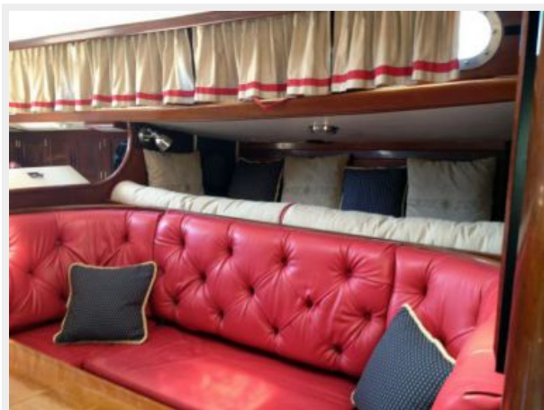
Port Settee with Pilot Berth Outboard