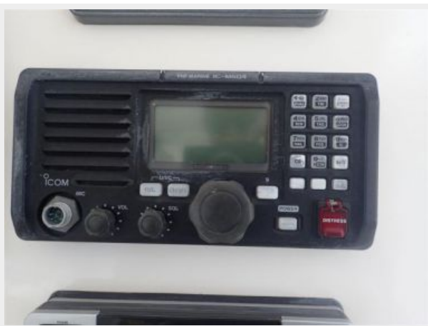
ICOM VHF Marine IC M604