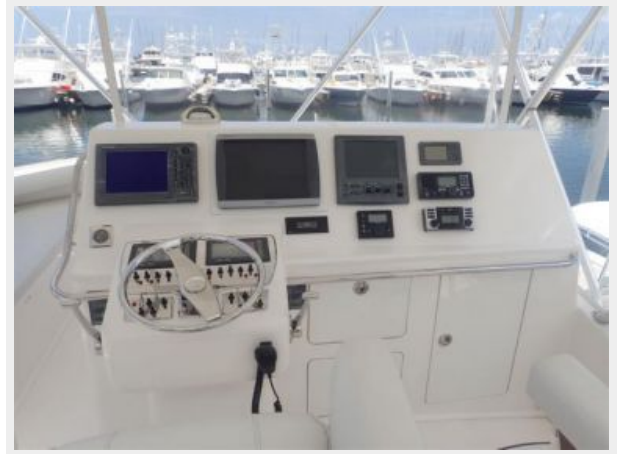
Flybridge Helm Electronics