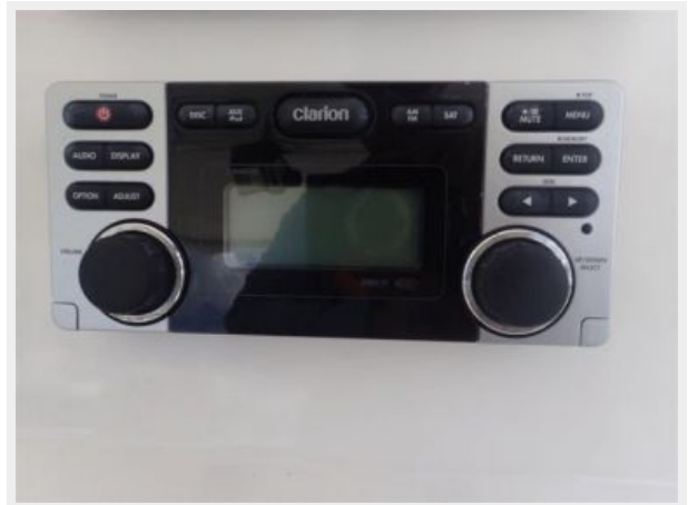
Clarion Stereo System