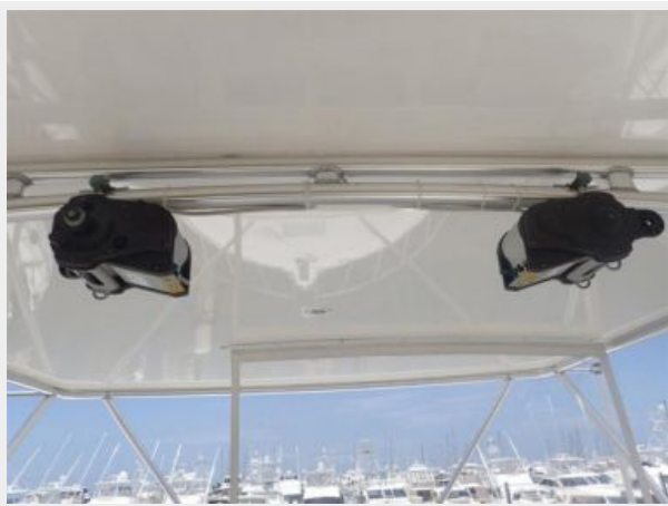
Electronic Reels for Outriggers