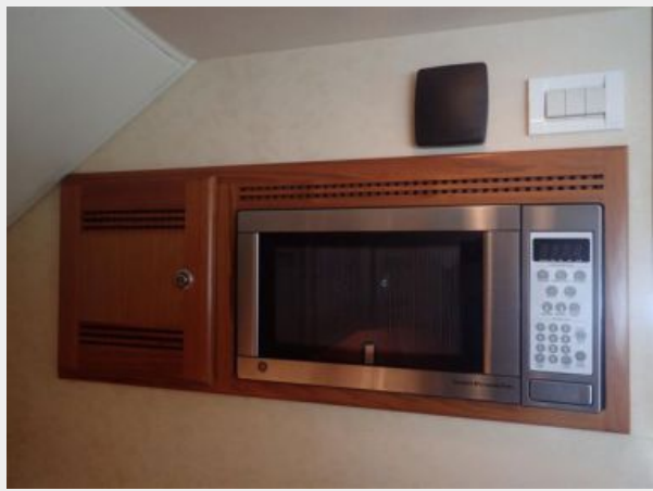
GE Turntable Microwave Oven