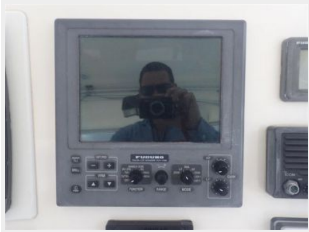
Furuno Color LCD Sounder