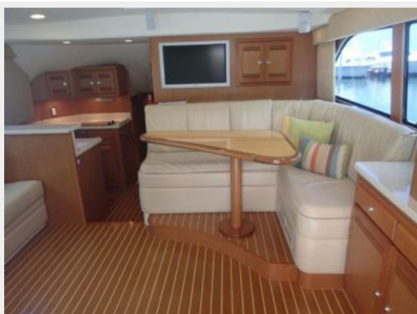
Main Salon Forward