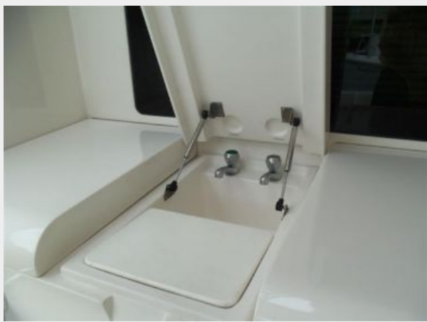
Sink with Freshwater & Salt Taps