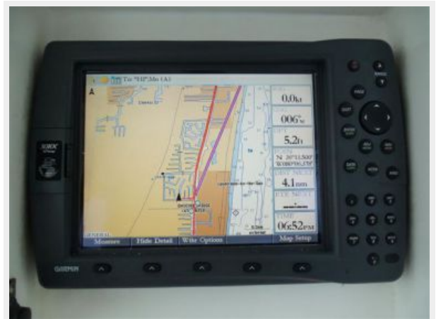
Garmin GPS Page