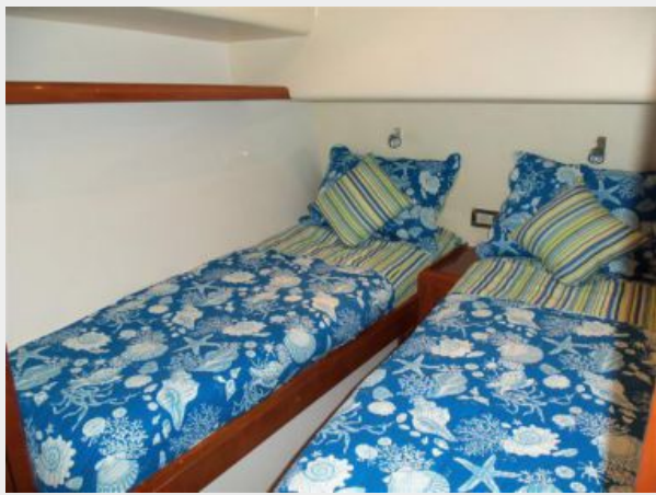
Guest Cabin Looking Aft