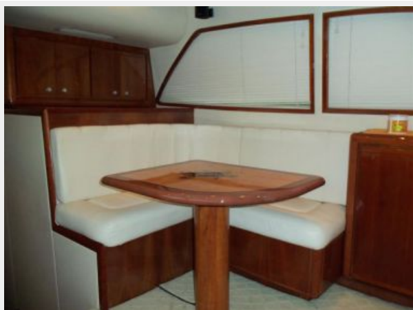
Salon Dining Forward