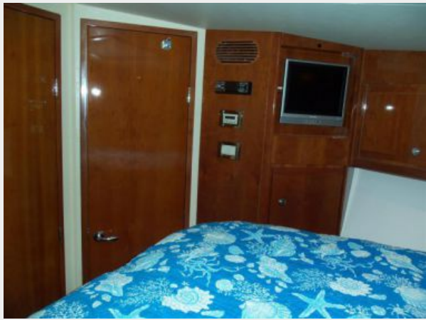
Master to Port