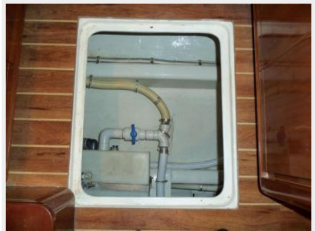
Storage Under Galley