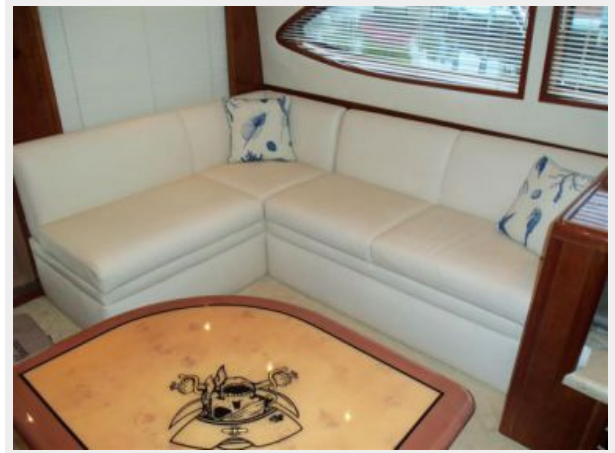
Salon to Port