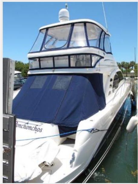
Quarter Profile II