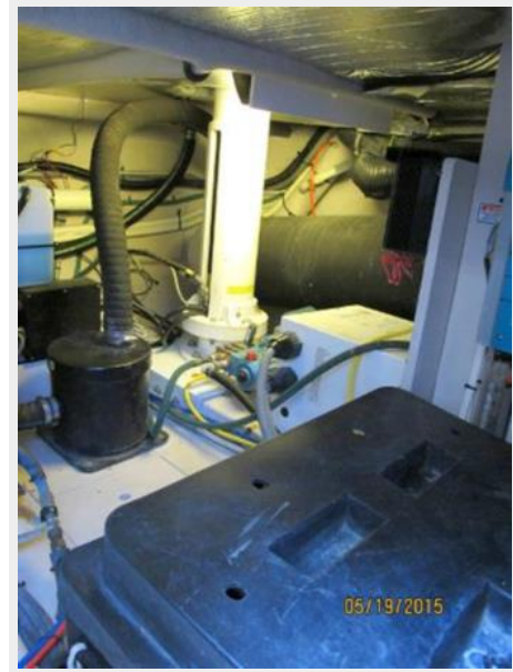
Clean Engine Room VII