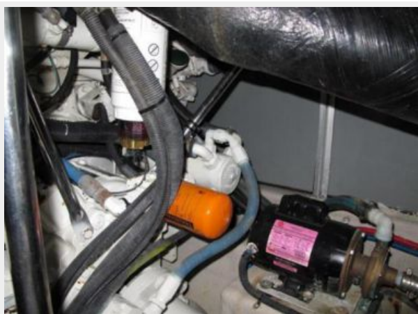
Clean Engine Room IV