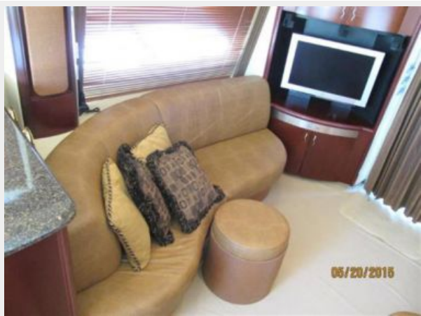
Salon to Starboard