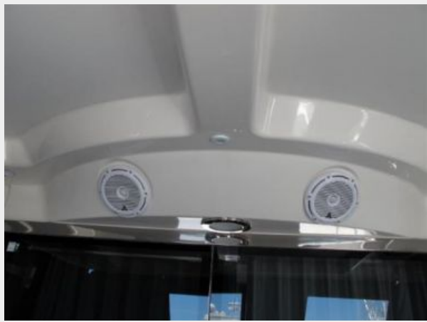
Aft Cockpit Speakers