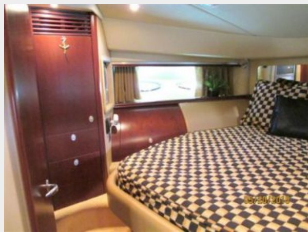
VIP to Port