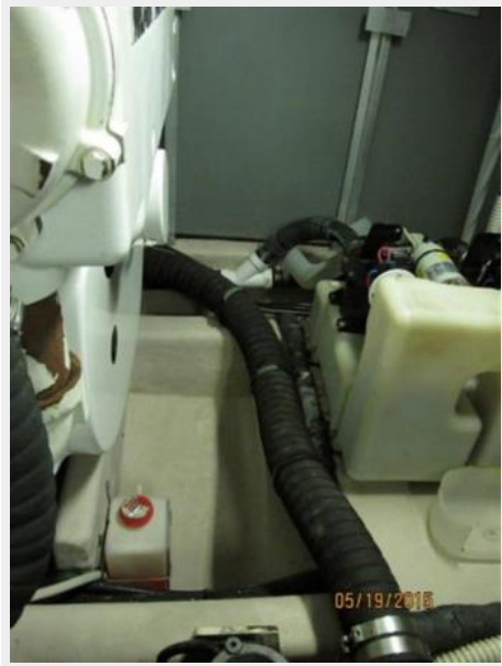
Clean Engine Room VI