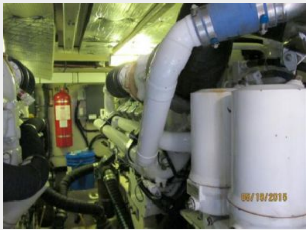
Clean Engine Room II