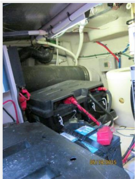
Clean Engine Room VIII