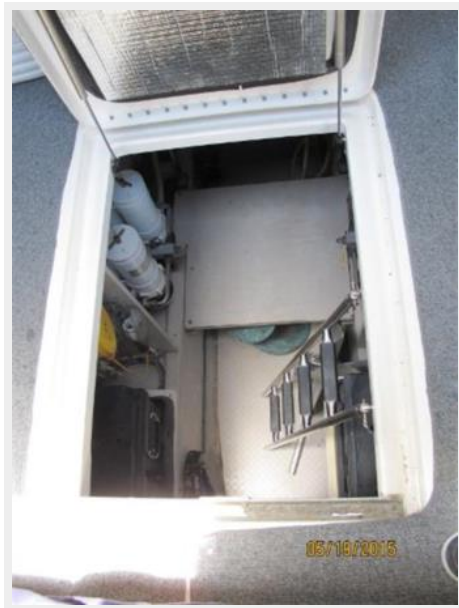
Clean Engine Room