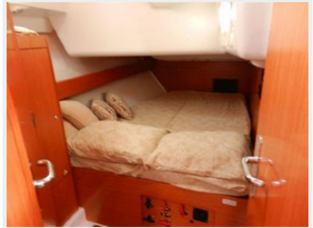
starboard guest cabin