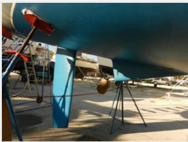
rudder and prop