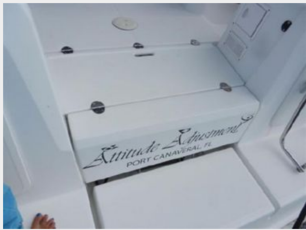
stern transom walkthrough