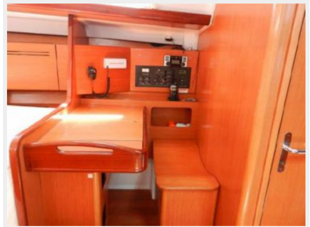
forward facing nav desk