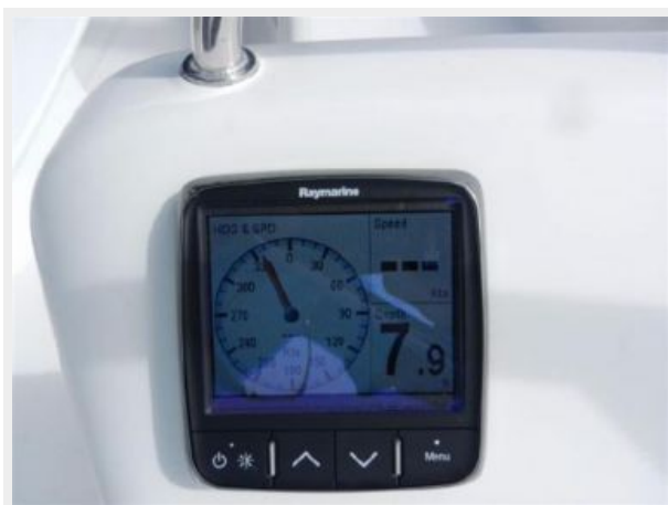
NEW helm display starboard