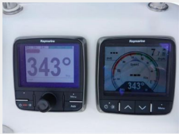
NEW helm displays port