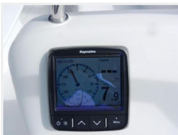
NEW helm display starboard