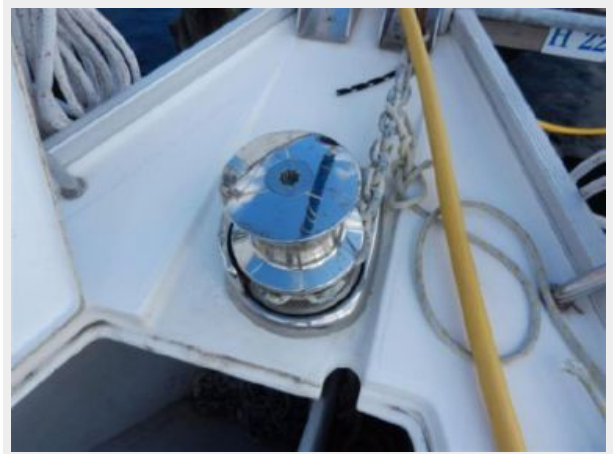
electric windlass w/ handheld control