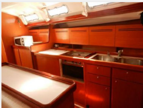
galley and center counter