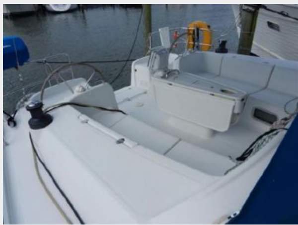
spacious cockpit and dual helm