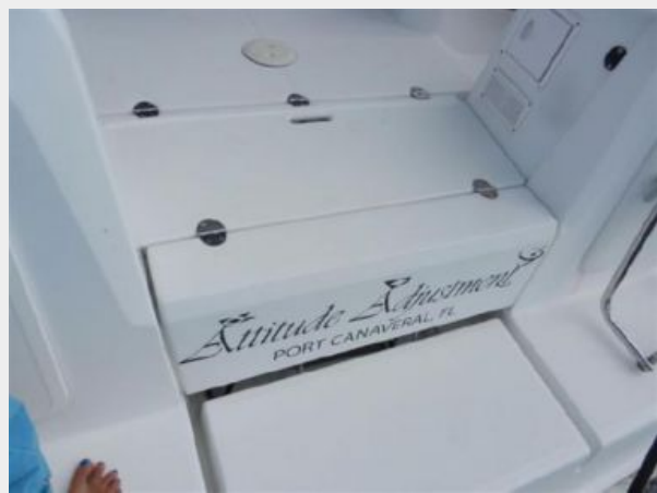
stern transom walkthrough