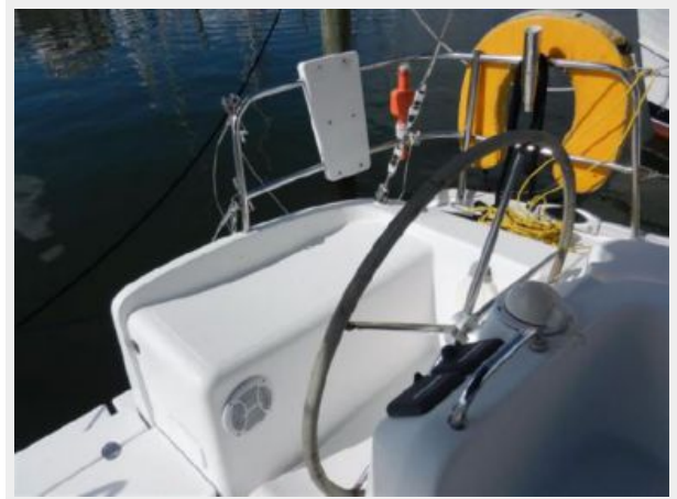
port helm station looking aft