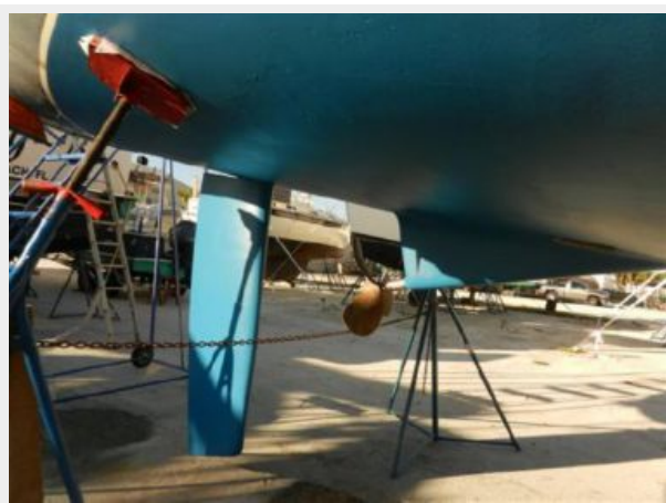
rudder and prop