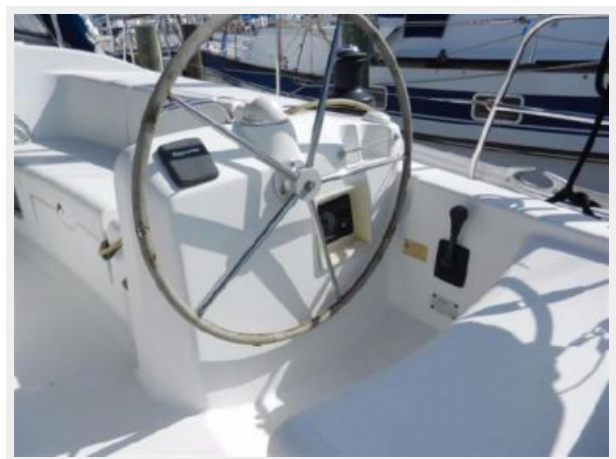
starboard helm station