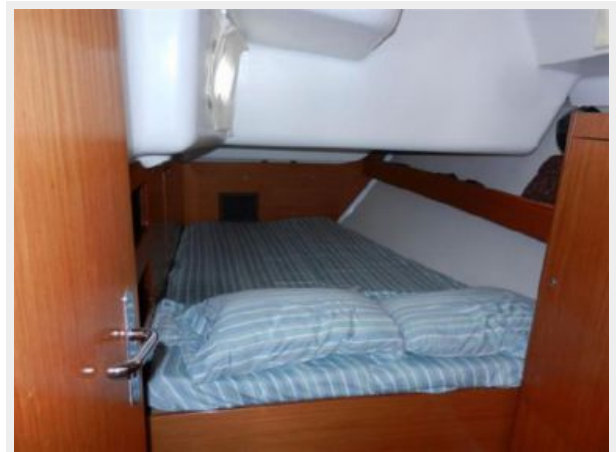
port guest cabin