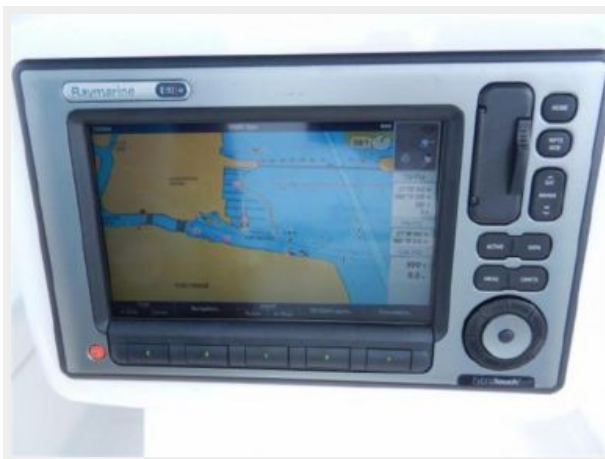
Raymarine E90W chartplotter/GPS