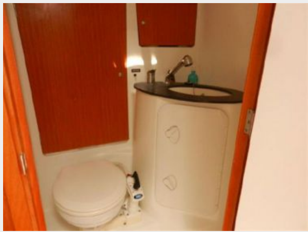
head 1 of 5