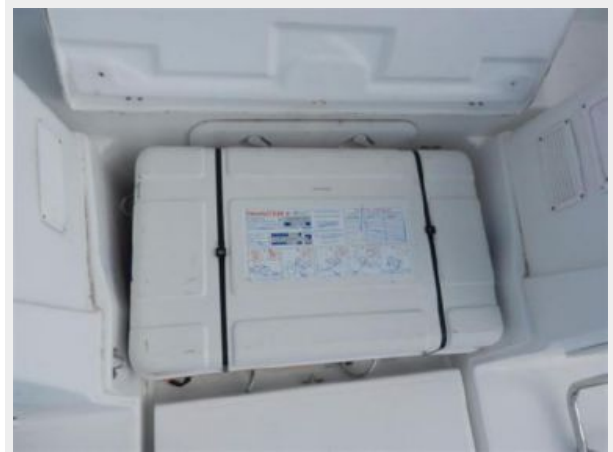
10 man liferaft - needs re-cert