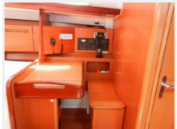
forward facing nav desk