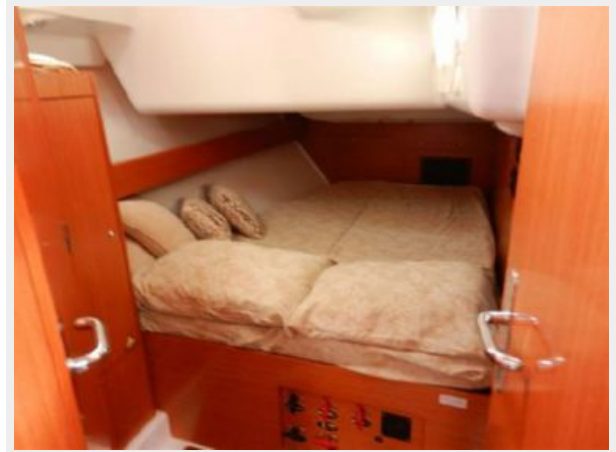
starboard guest cabin