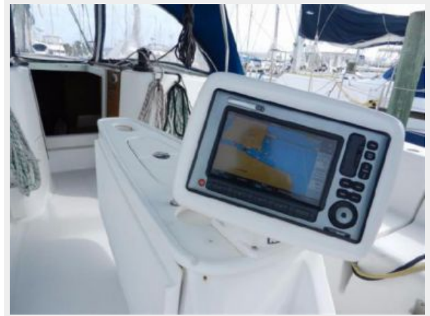
NEW Electronics on swiveling navpod