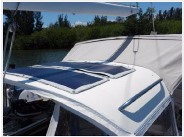
flexible solar panels