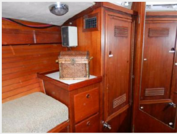
Aft cabin seat and lockers