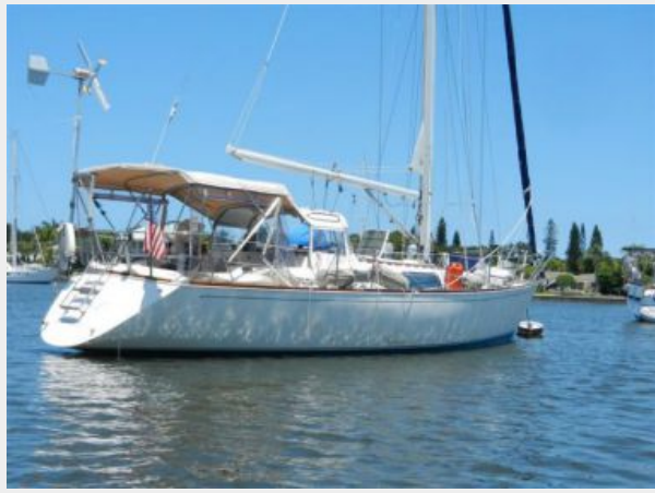
Starboard Stern quarter