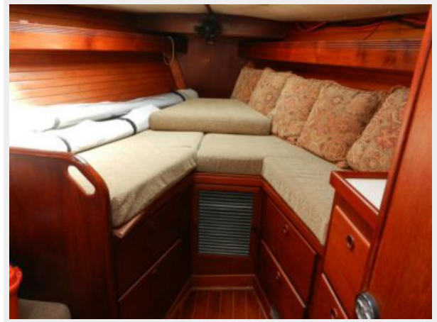
V berth with filler