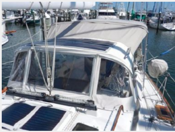
Wave stopper hard dodger