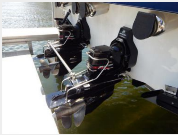
Bravo 3 Drives