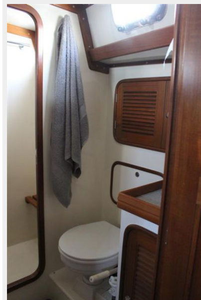
Tayana 48 DS Master Head