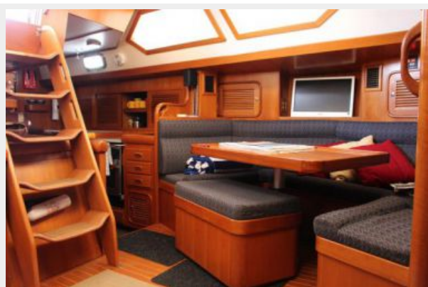
Tayana 48 DS Dinette