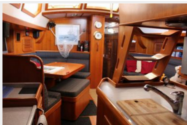
Tayana 48 DS Galley/Dinette