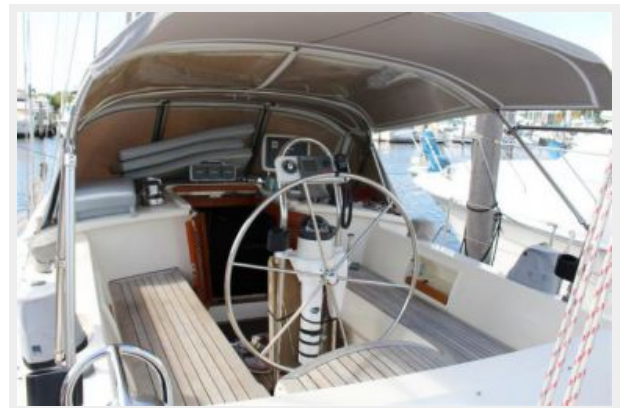
Tayana 48 DS Cockpit