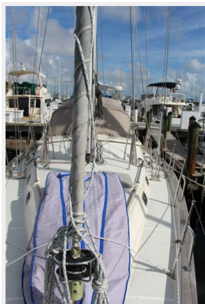
Tayana 48 DS Forward Deck