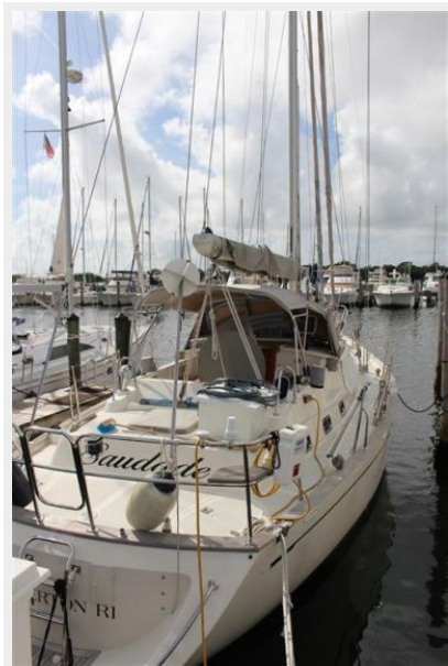
Tayana 48 DS Aft Deck