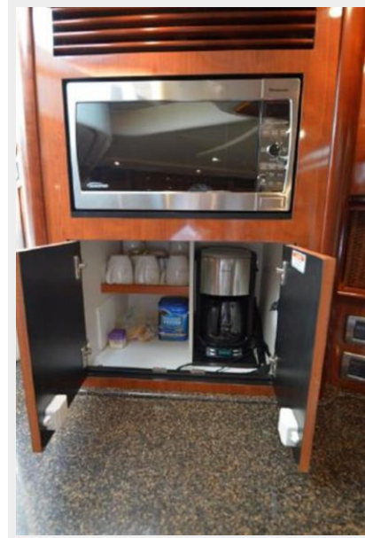
Galley Microwave and Coffee Maker