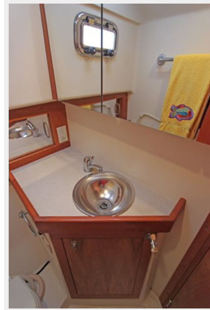
Head with stainless steel sink, vanity, storage