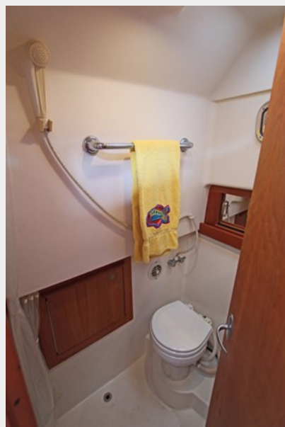
Head with electric toilet and shower head