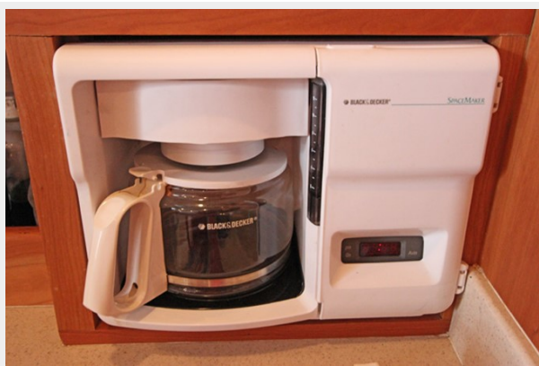
Black & Decker Spacemaker