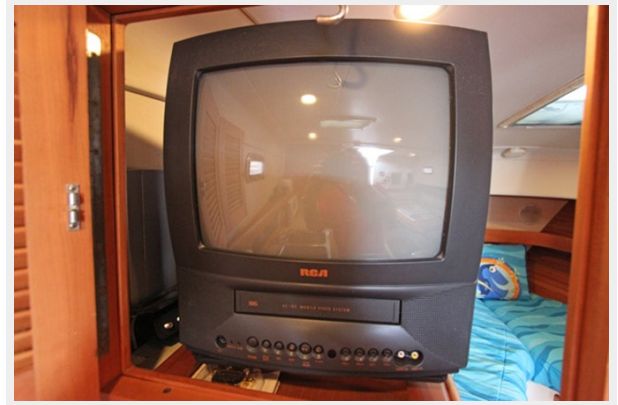
RCA TV/VCR that swivels from stateroom to dining area for viewing