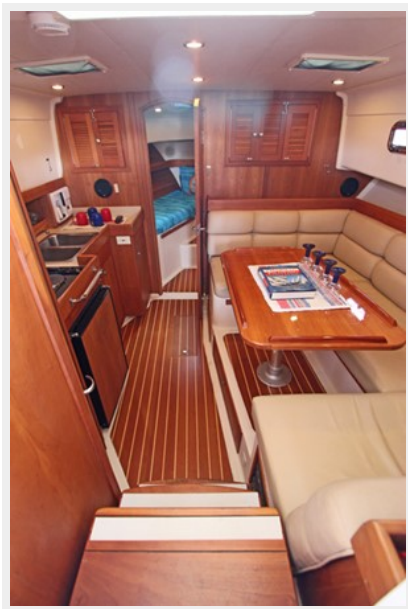
Entering the beautiful cabin with teak & holly sole