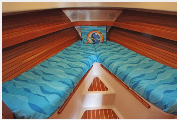
Forward Stateroom with queen berth with filler cushion