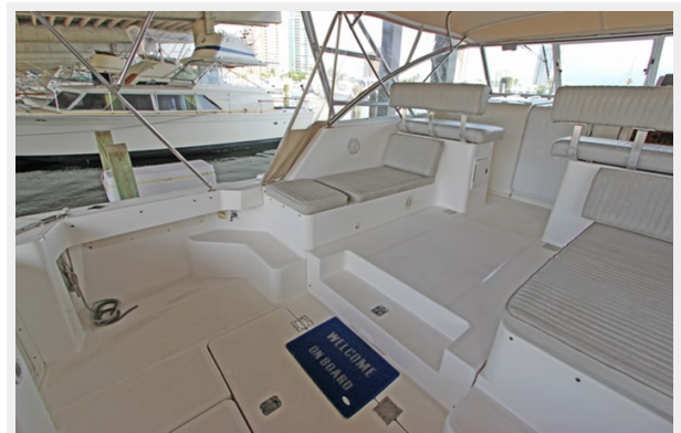
Port Cockpit with guest seating and storage below