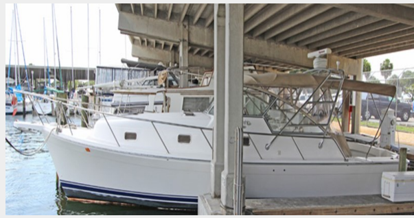
Port View in covered slip