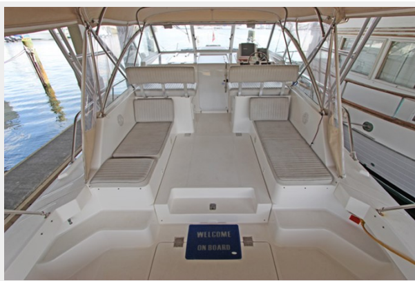
View of Cockpit forward