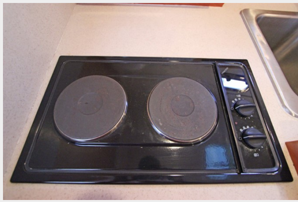
Princess 2-Burner Electric Stove Top