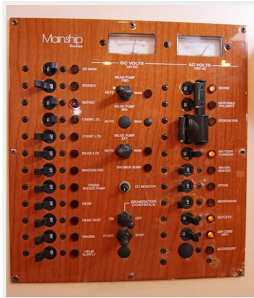
Electrical Panel just inside cabin area to starboard