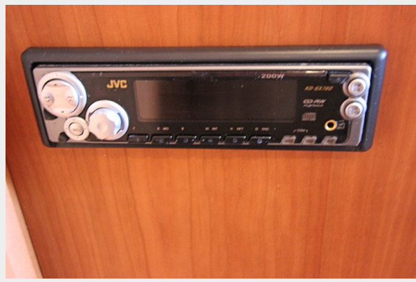
JVC Stereo w/CD