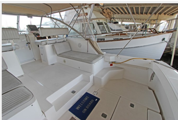
Starboard Cockpit Seating with storage below