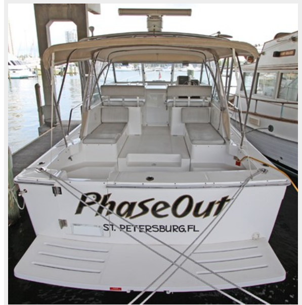
View of Stern and huge cockpit with extended swim platform