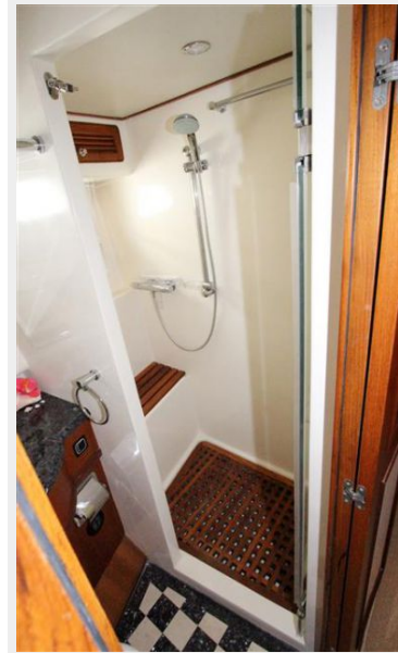
Guest Stall Shower