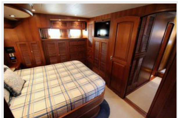
Master Stateroom, Port