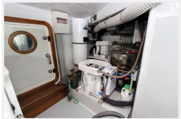
Fuel filtration and Port Engine Room Access