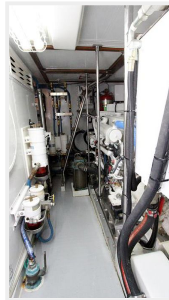
Fuel filtration and Port Engine Room Access