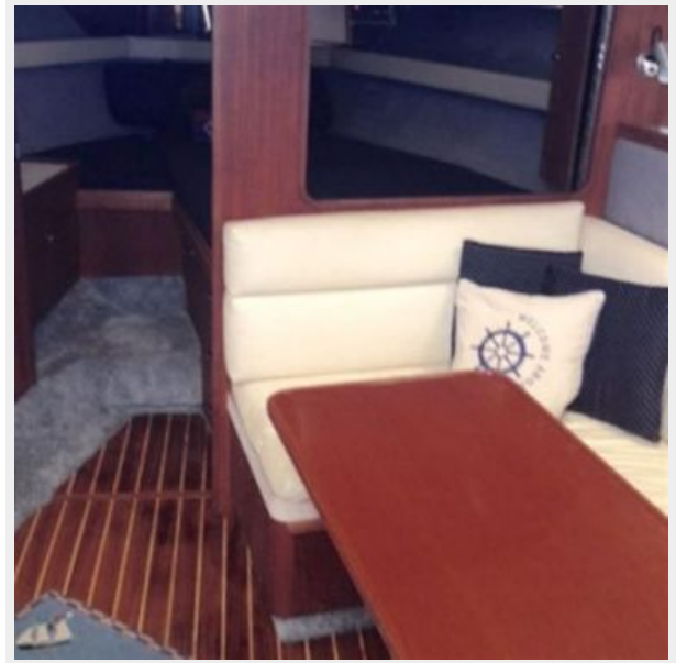
View aft from galley