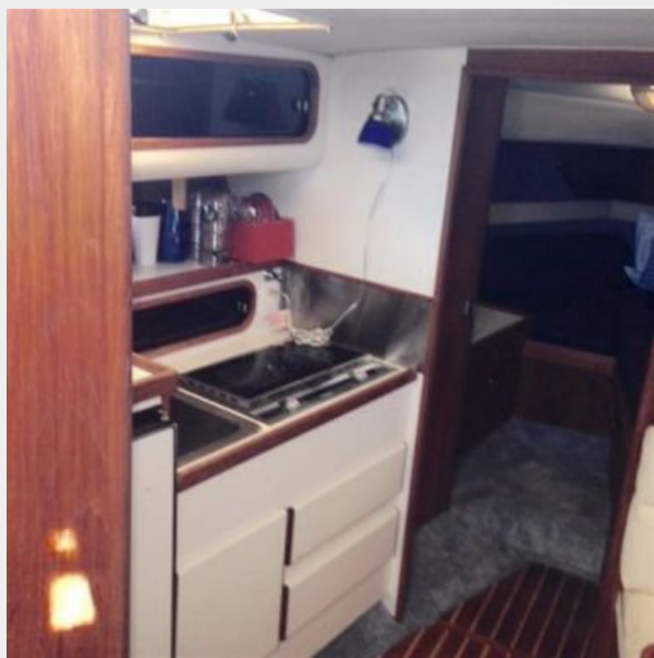
Looking forward from cabin entry (galley)