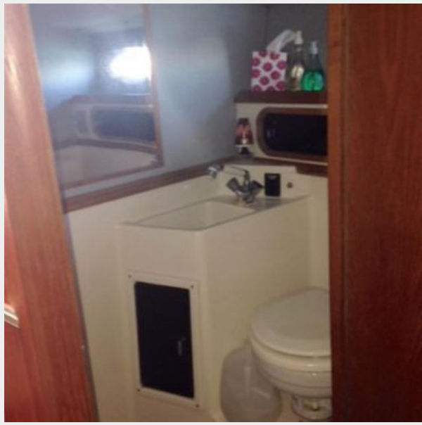
Large enclosed head with shower and ample storage