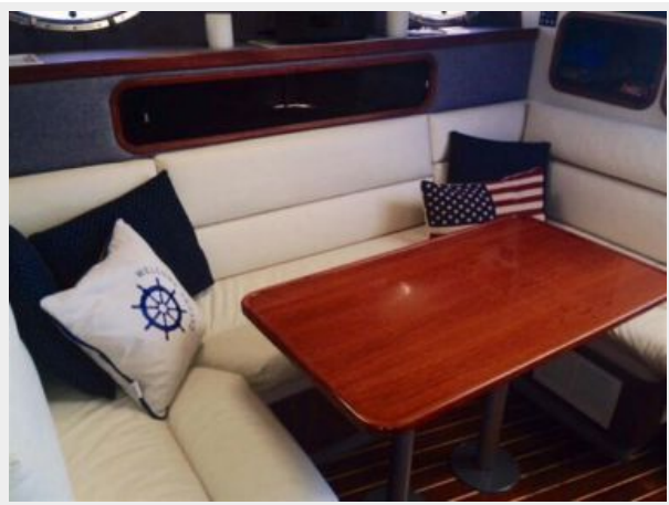
Settee and teak varnished table