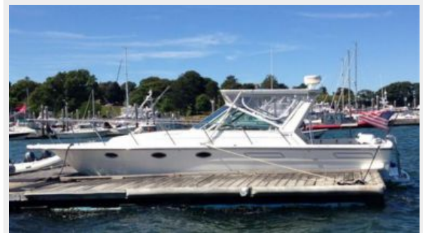
Port profile, September 2014