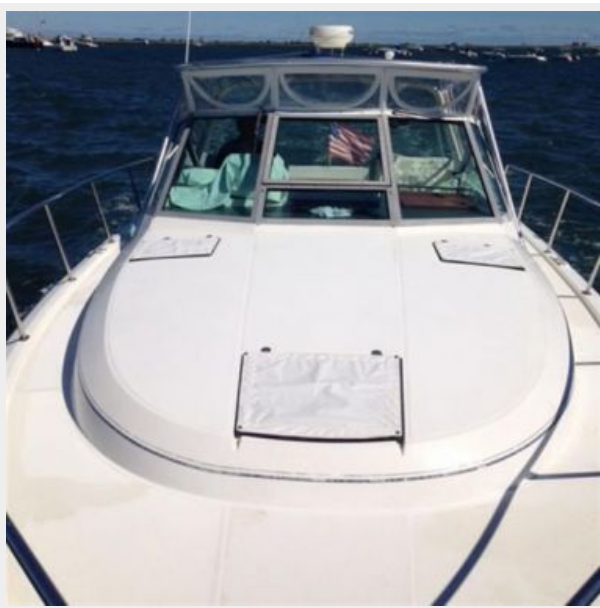
From the pulpit