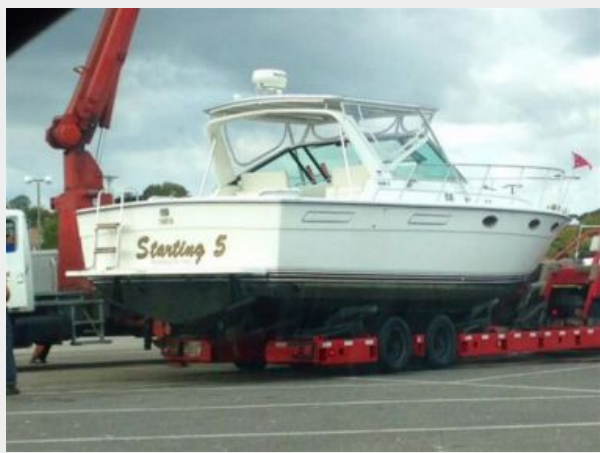
Hauling October 2014