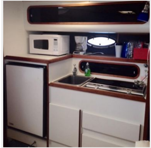
Full galley. SS sink, microwave, refrigerator, 2 burner electric stovetop and plenty of storage