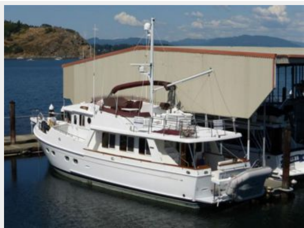
At the Dock stern