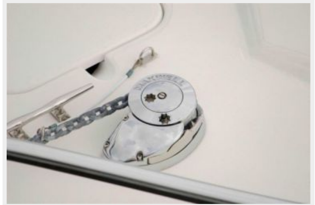
Windlass Chain / Rode