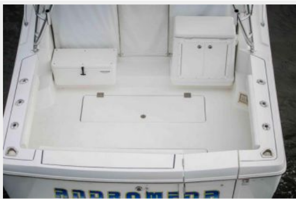
Fishbox to Port / Tackle Station to Starboard