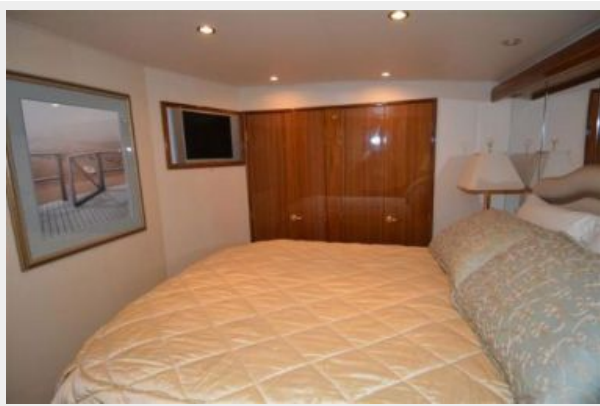
Master Stateroom Hanging Lockers