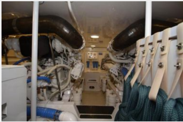
Engine Room Center