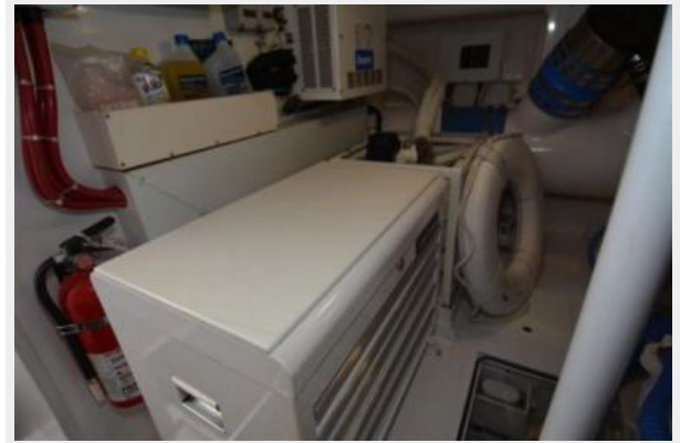
Engine Room Tool Box