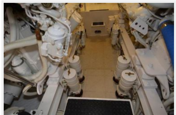
Engine Room 2