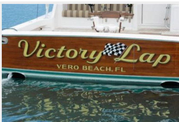
Stern Teak Transom