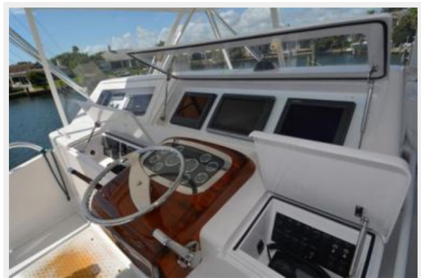
Teak Helm Pod