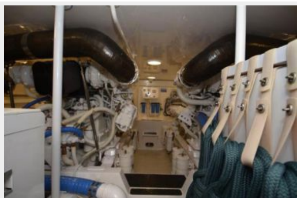
Engine Room Center