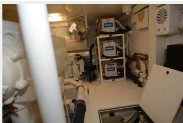
Engine Room Forward Port