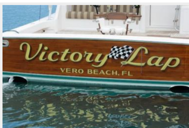
Stern Teak Transom