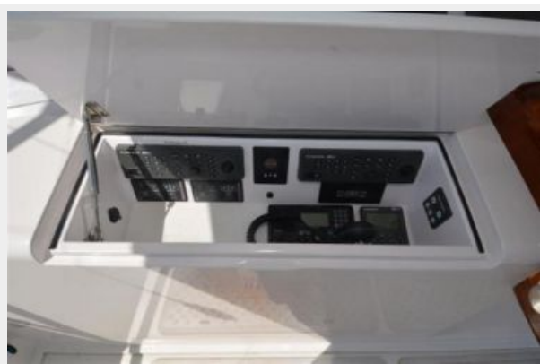
Port Radio Box