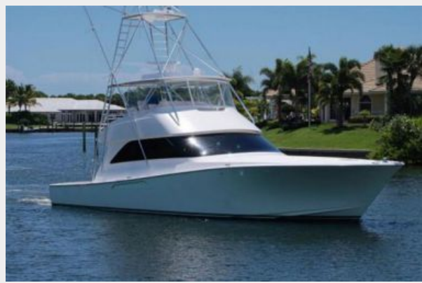
56' Viking Victory Lap