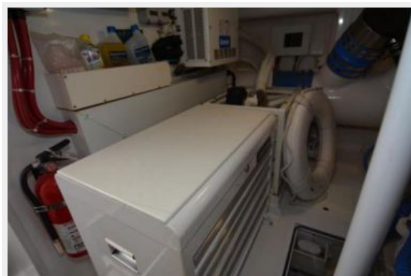
Engine Room Tool Box