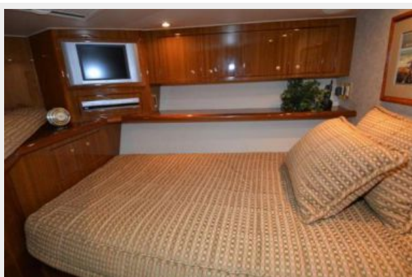
Forward Stateroom Lower Berth