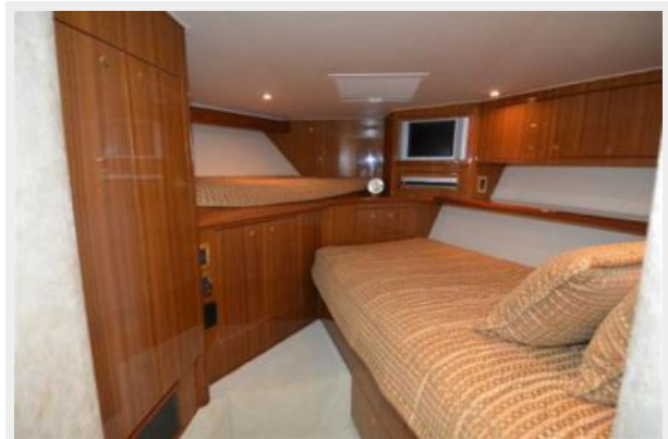
Forward VIP Stateroom