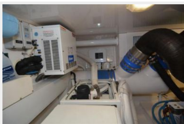
Engine Room Aft