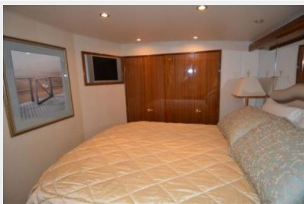
Master Stateroom Hanging Lockers