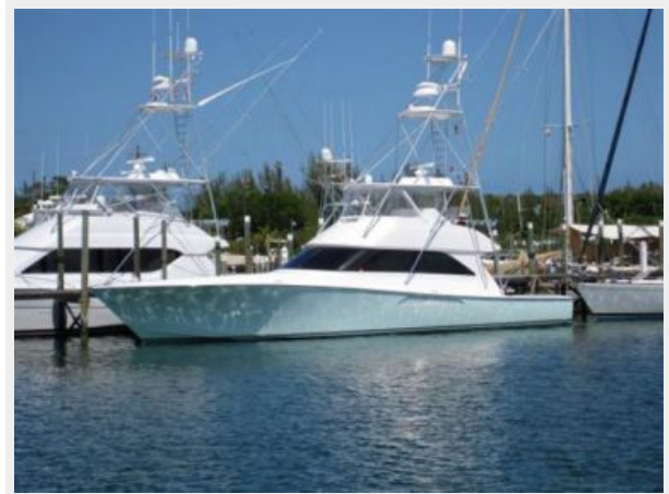
At the Dock