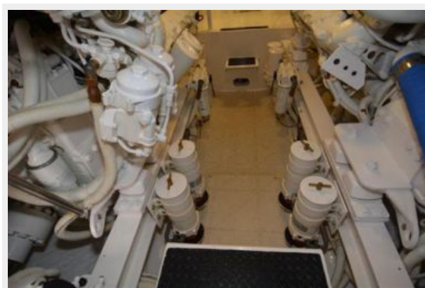
Engine Room 2