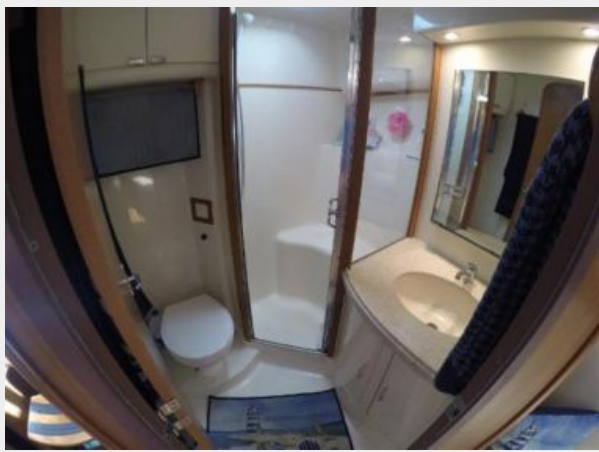
Head / Shower