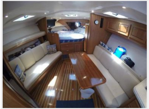
Cabin - Facing Forward