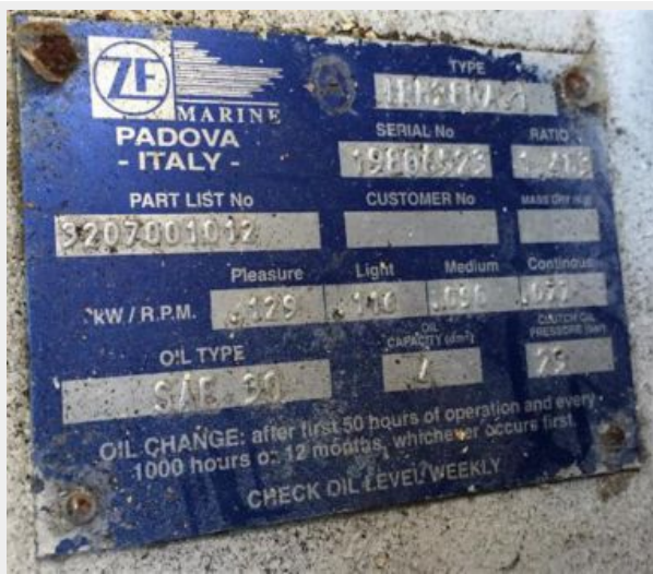
Port ZF Transmission