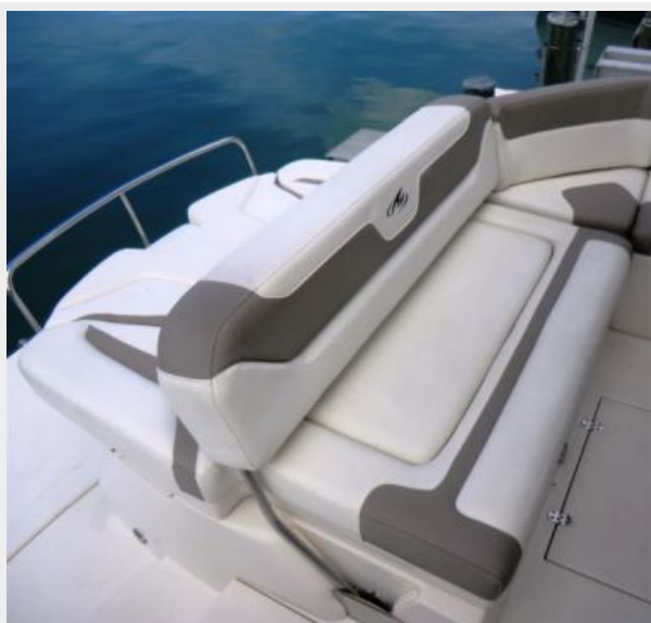
Sun Island Lounge