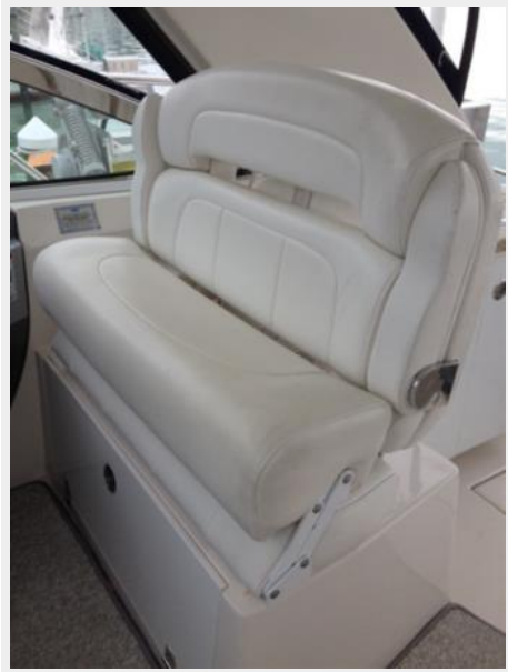
Helm Seat Raised