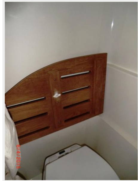
Guest Toilet with Teak Seat