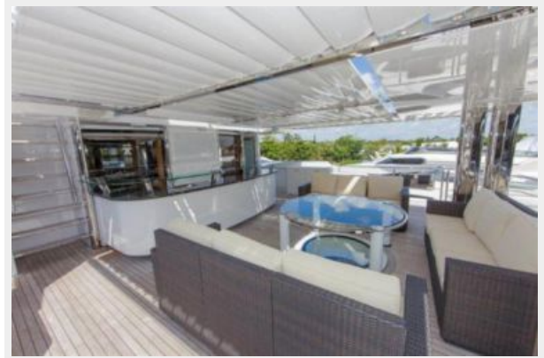
Upper Aft Deck