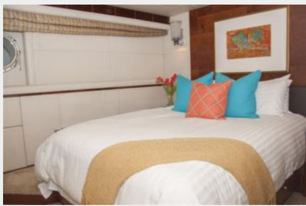
Queen Midship Port