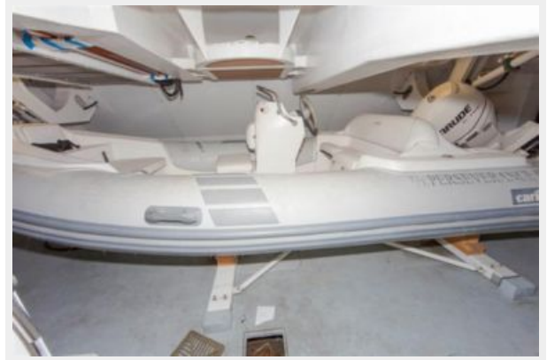
Tender in Garage Stowage