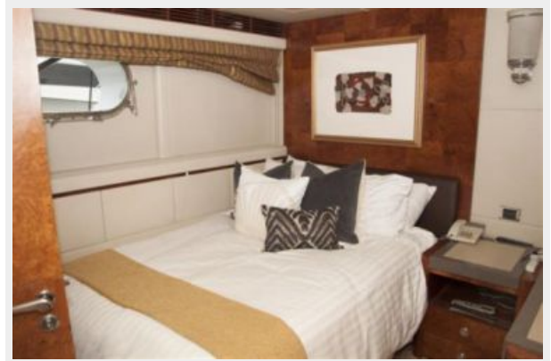
Forward Queen Starboard