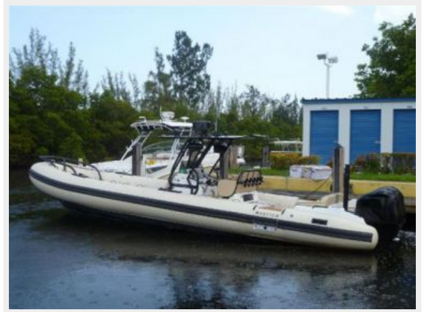
T-top with outriggers