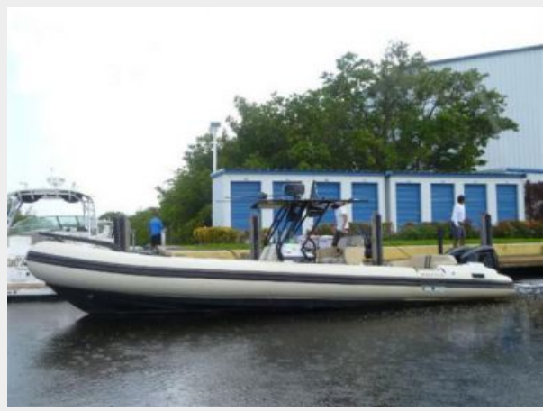
Twin painted Yamaha F250