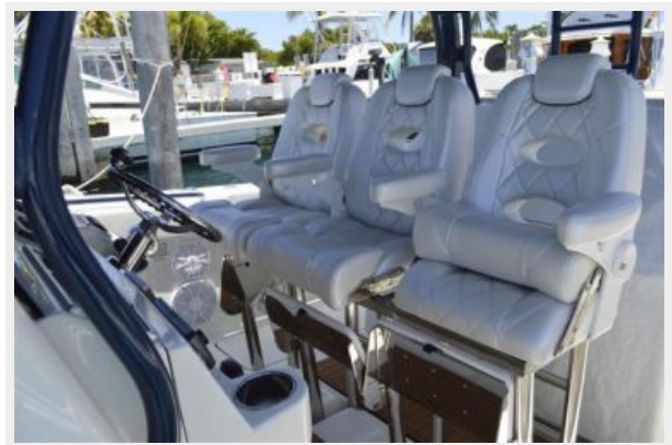
Triple Helm Seating