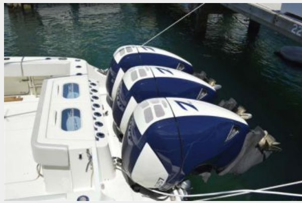
Live Wells and Rod Holders