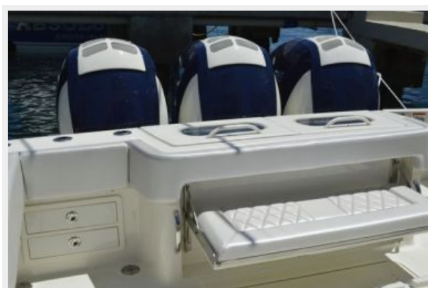
Stern Bench Seat